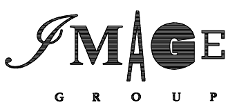
IMAGE GROUP INC. 403 CENTER AVENUE, SUITE 300 MOORHEAD, MN 56560

Dept. of Veterans Affairs Health Care System 2101 Elm Street North Fargo, ND 58102