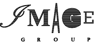
IMAGE GROUP INC. 403 CENTER AVENUE, SUITE 300 MOORHEAD, MN 56560

Dept. of Veterans Affairs Health Care System 2101 Elm Street North Fargo, ND 58102