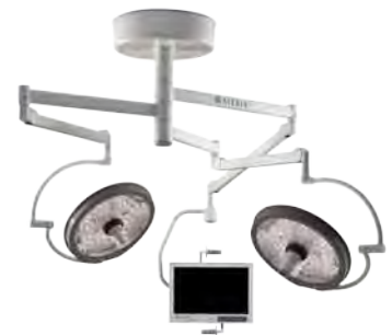
Harmony vLED System