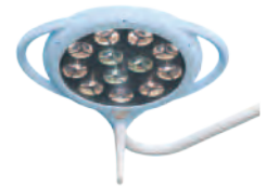
Ergonomic side handles