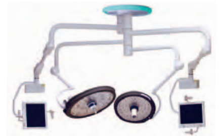
Harmony LED System

The Harmony LED385 is a great addition to our complete line of LED lighting systems