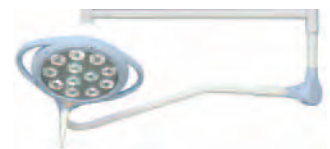
Harmony LED385 System

For more information, please call your STERIS Account Manager or visit www.steris.com .