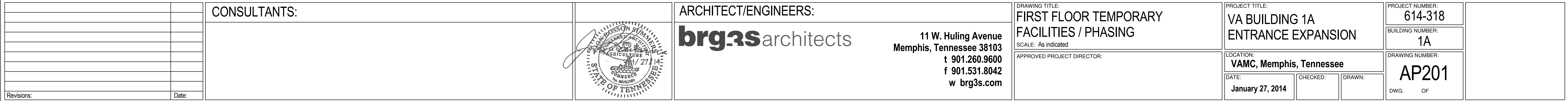
1 FIRST FLOOR PHASING PLAN SCALE: 1/8" = 1'-0"