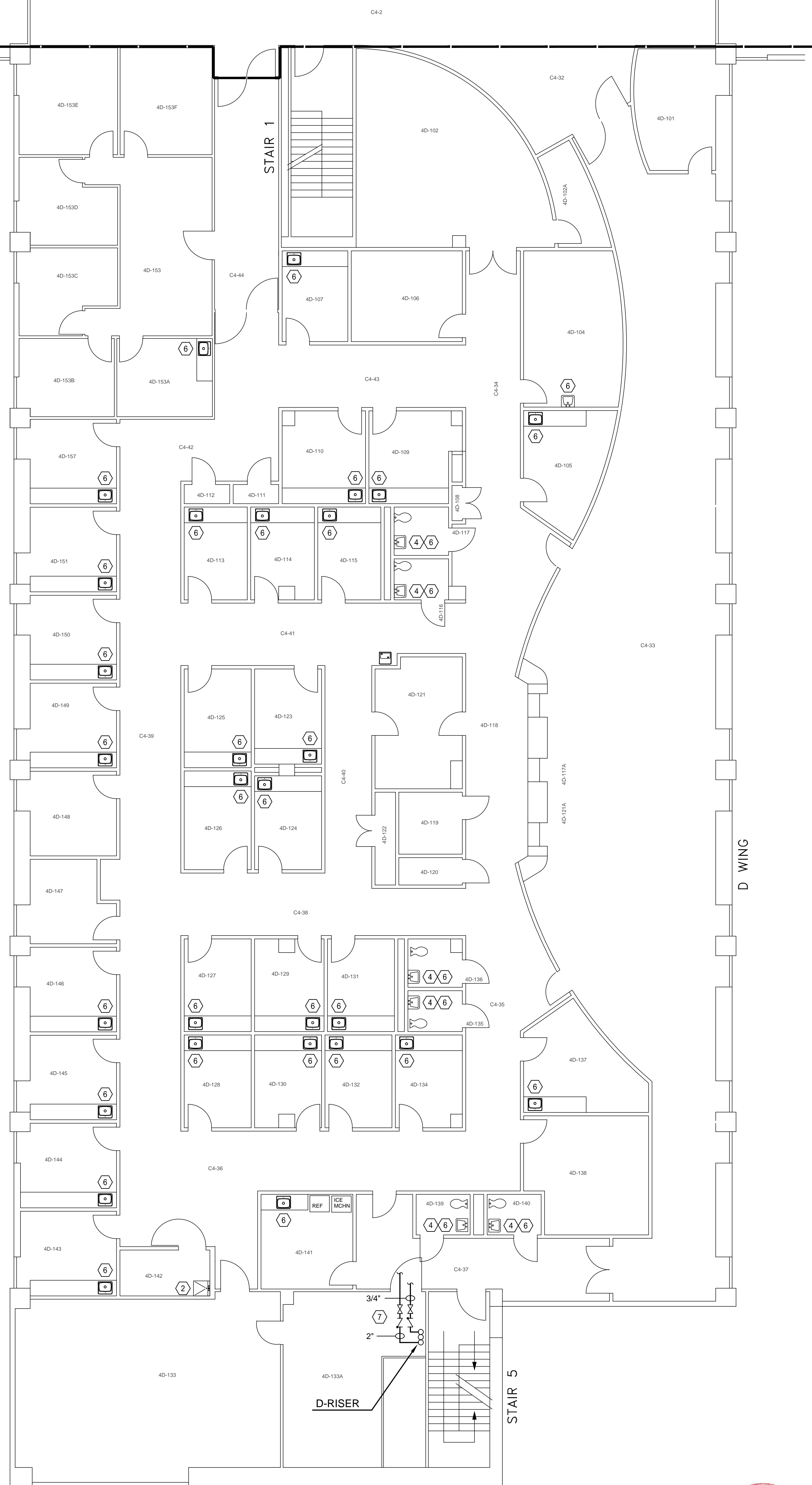
I.C. CLASS II FOURTH FLOOR - D WING PLUMBING PLAN