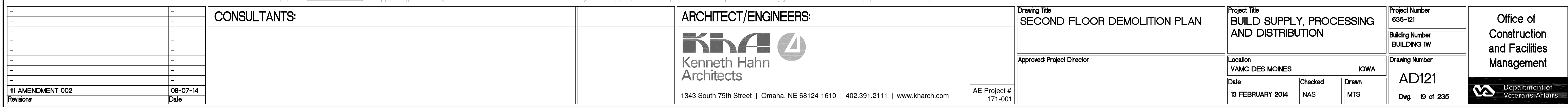
1 SECOND FLOOR DEMOLITION PLAN (PHASE ONE AND TWO) 0' 8' 16' 24' 1/8'