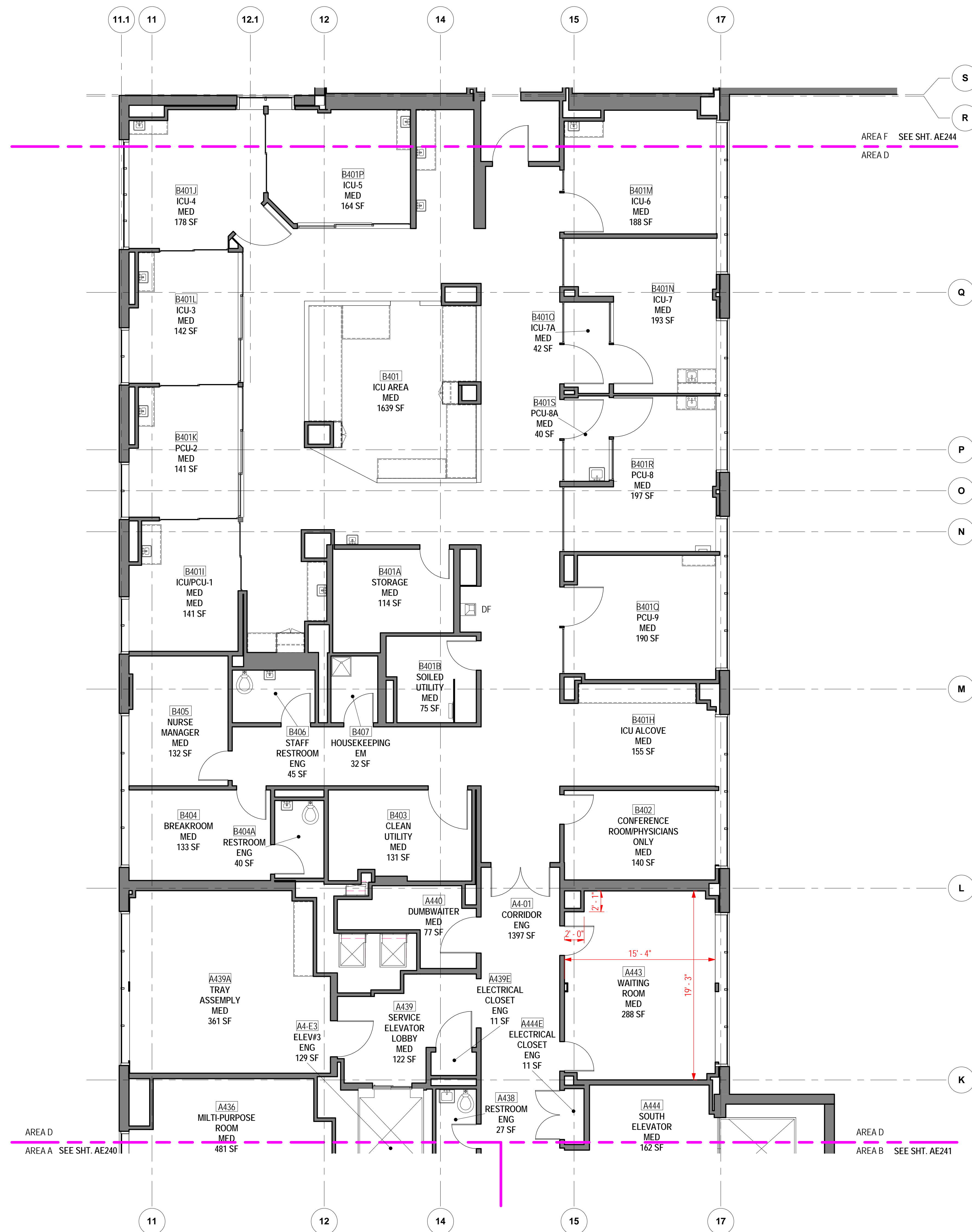
① LEVEL 4 - AREA D \frac{3}{16}'' = 1'-0''