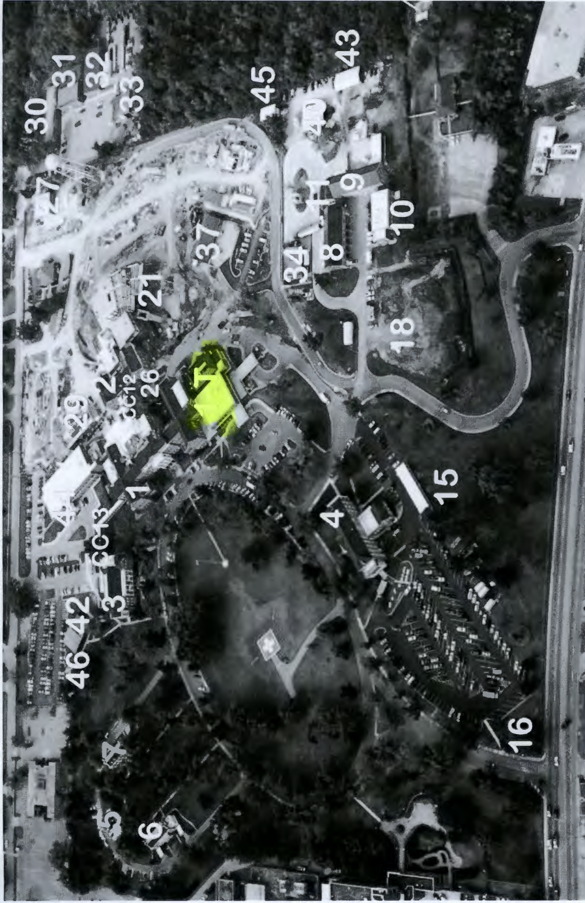
Buildings of Roof Service Contract