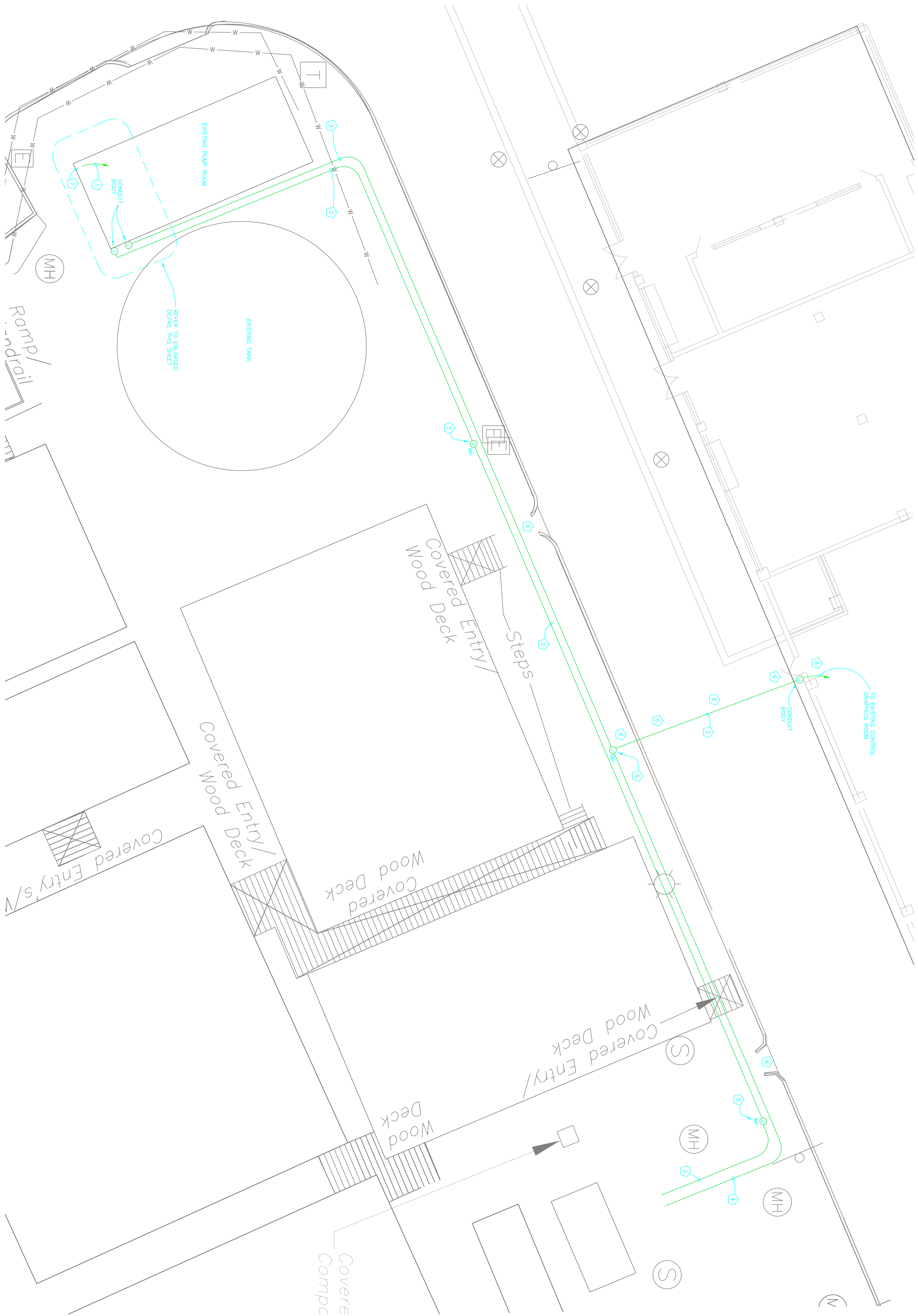
IRRIGATION ELECTRICAL PLAN SCALE: 1/8" = 1'-0" N