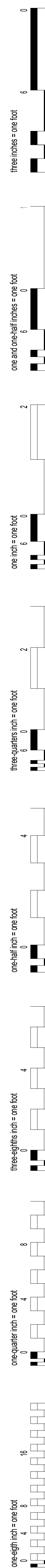
1 ARCHITEC 1/8" = 1'-0"