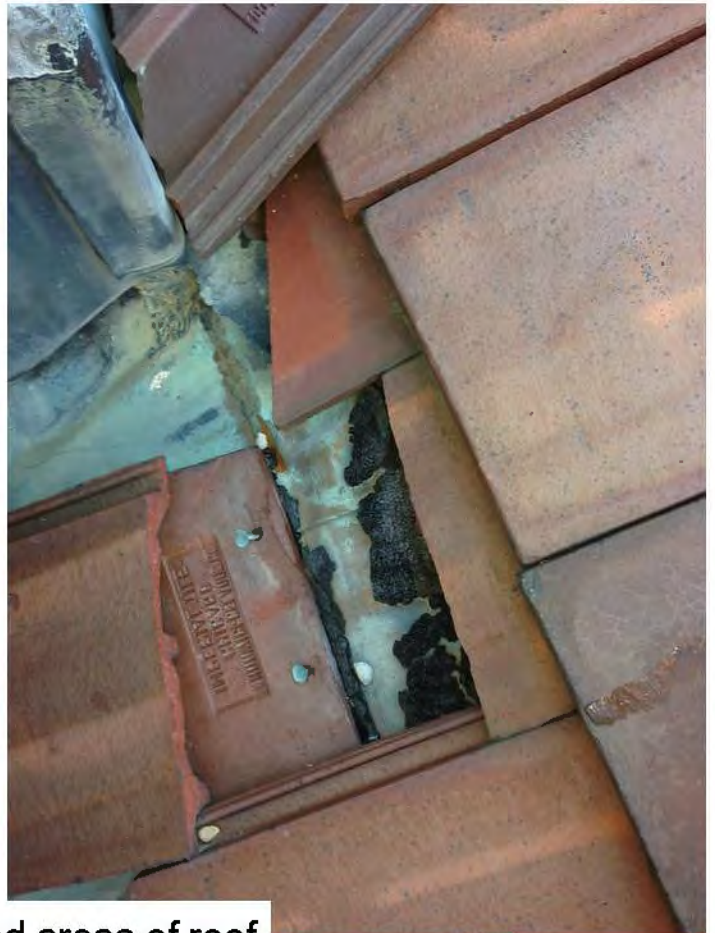
Samples: Affected areas of roof