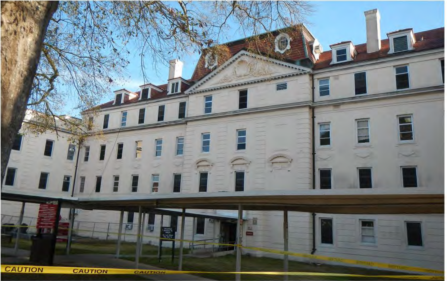
Above: Rear view of Bldg 2 from ground