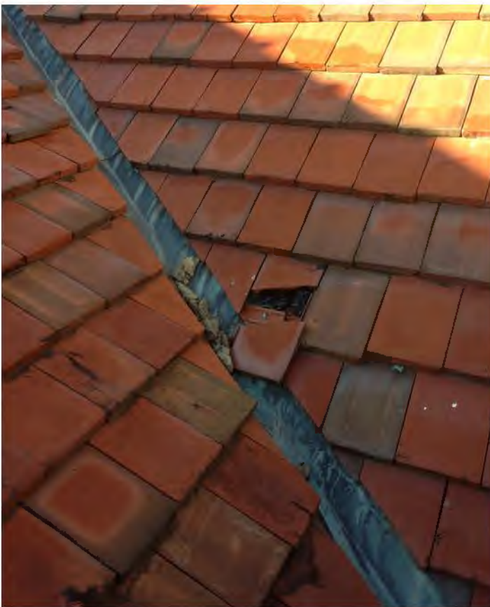
Below: Affected tiles on front of roof