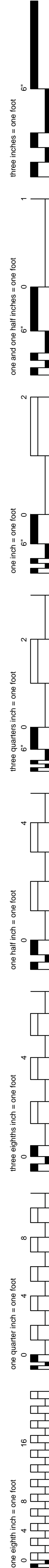
Scale: 1/8" = 1'-0"