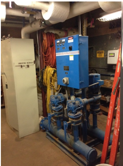
Current building booster pump, ground floor building 5, E07