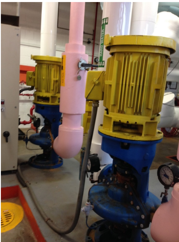
Current water tower pump in building 11