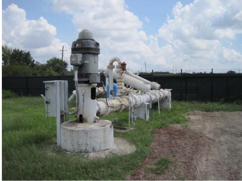
Figure 1: Well head and pump motor