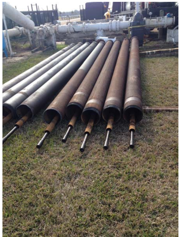
Figure 3: Pulled 10" pipe and tube shaft (currently still on site)