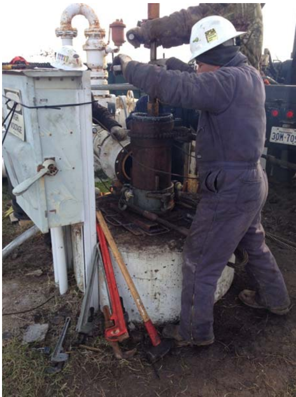
Figure 2: Pulling the pump