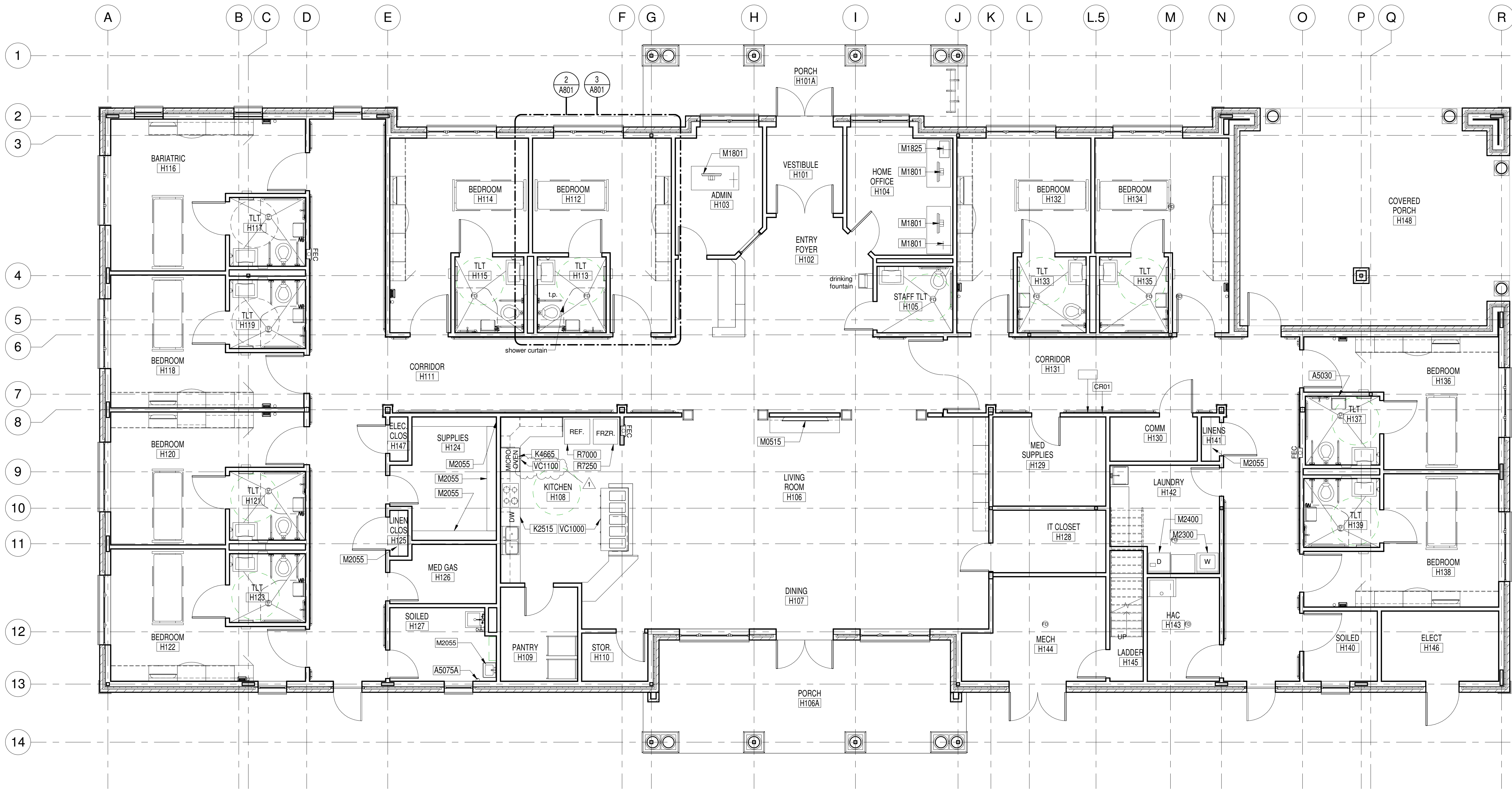
1 FIRST FLOOR EQUIPMENT PLAN - 10 BED HOME A801 3/16" = 1'-0"