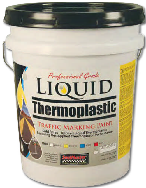
High Performance Traffic Marking Paint