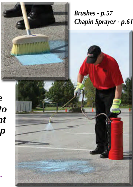
Brushes - p.57 Chapin Sprayer - p.61