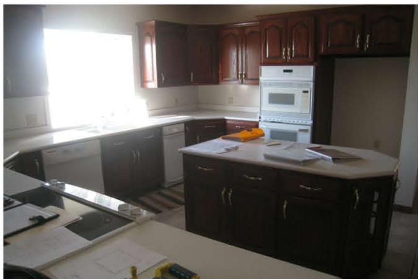
4-BUILDING B - LEVEL 1