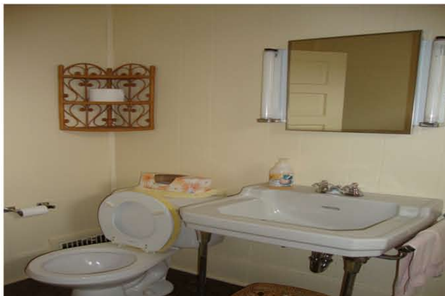
25-BUILDING B - LEVEL 2