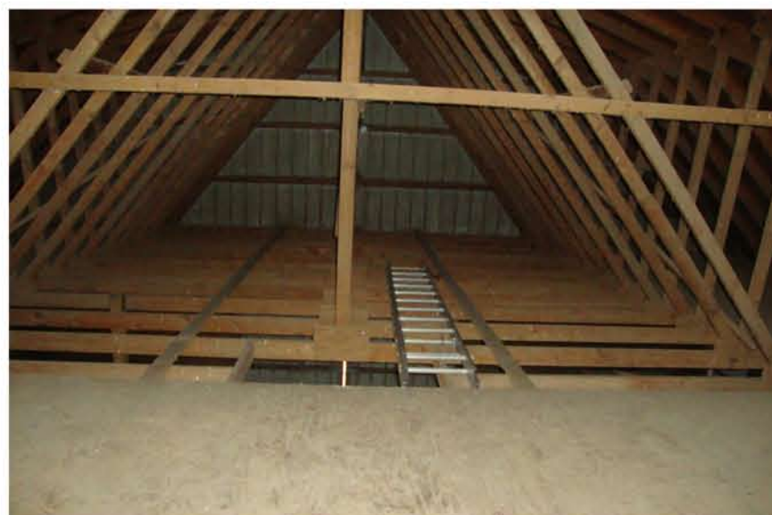
38-BUILDING D - LEVEL 2