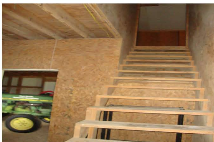
35-BUILDING D - LEVEL 1