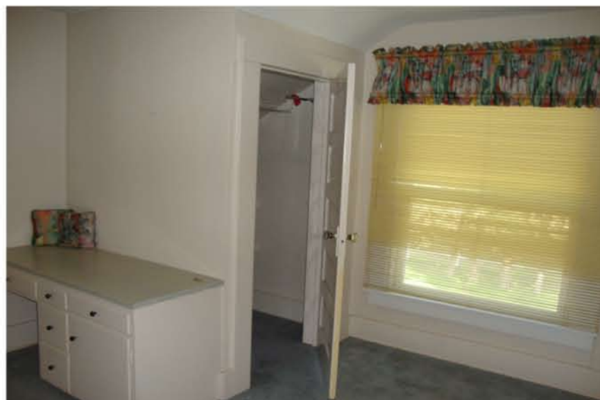
21-BUILDING B - LEVEL 2