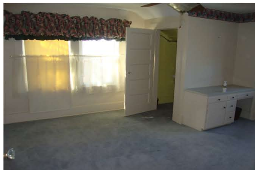
23-BUILDING B - LEVEL 2