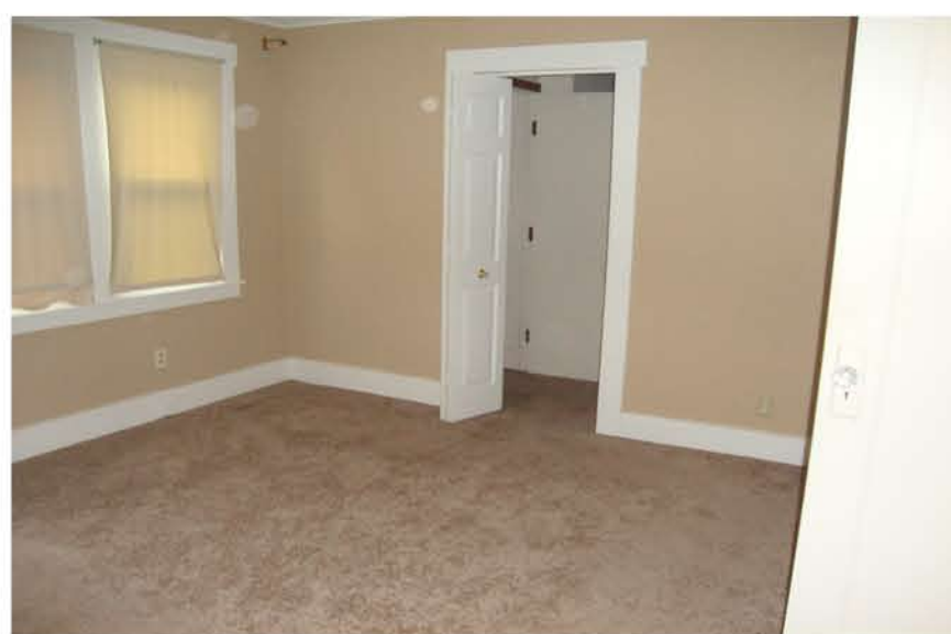
13-BUILDING B - LEVEL 1