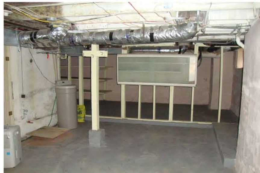
15-BUILDING B - BASEMENT