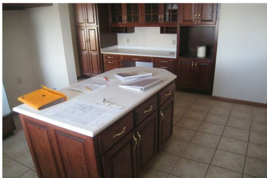
5-BUILDING B - LEVEL 1