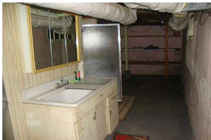
17-BUILDING B - BASEMENT