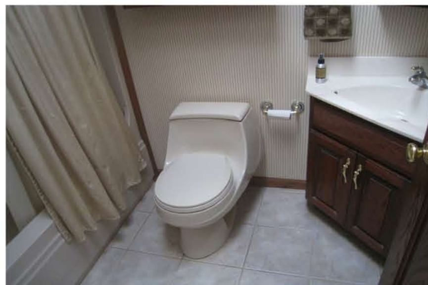
6-BUILDING B - LEVEL 1