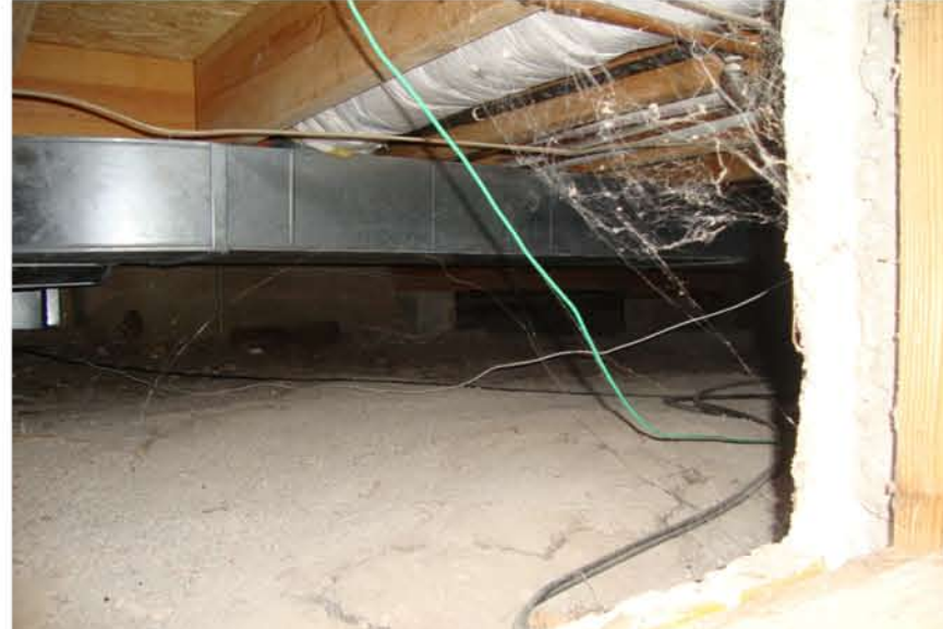
19-BUILDING B - BASEMENT