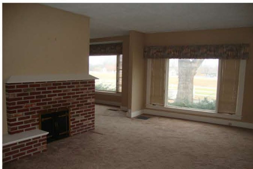
11-BUILDING B - LEVEL 1