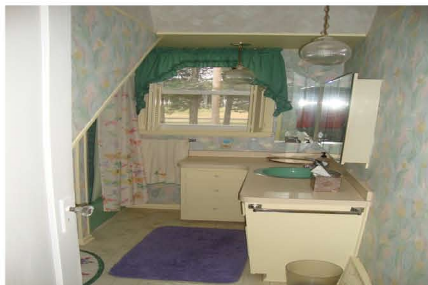
14-BUILDING B - LEVEL 1