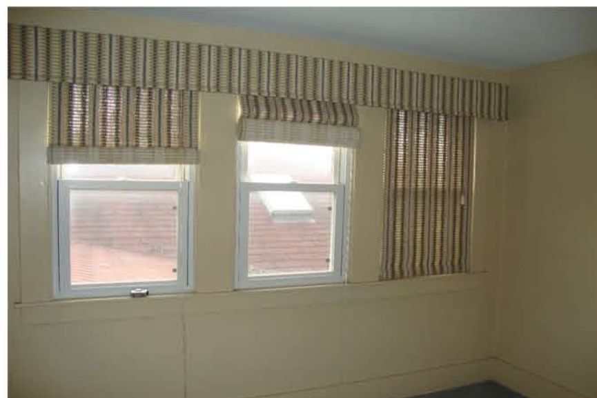
24-BUILDING B - LEVEL 2