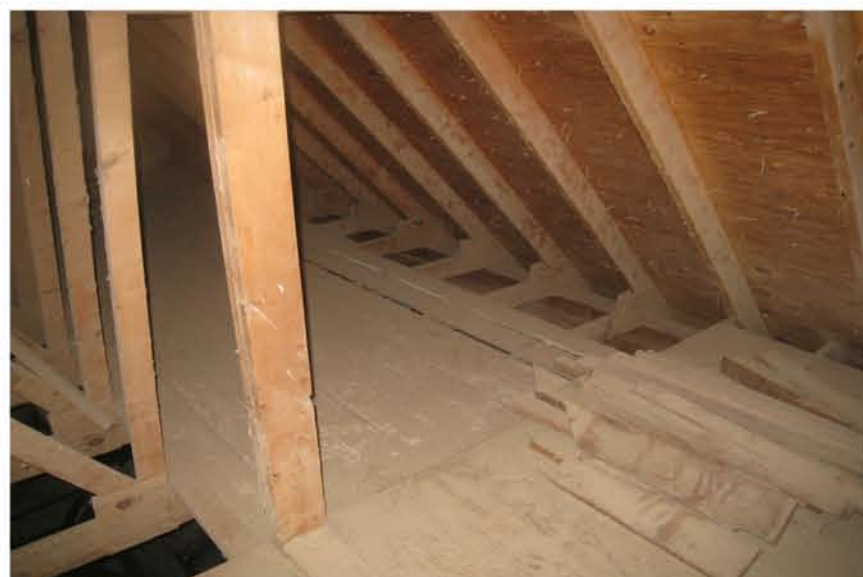
39-BUILDING D - LEVEL 2