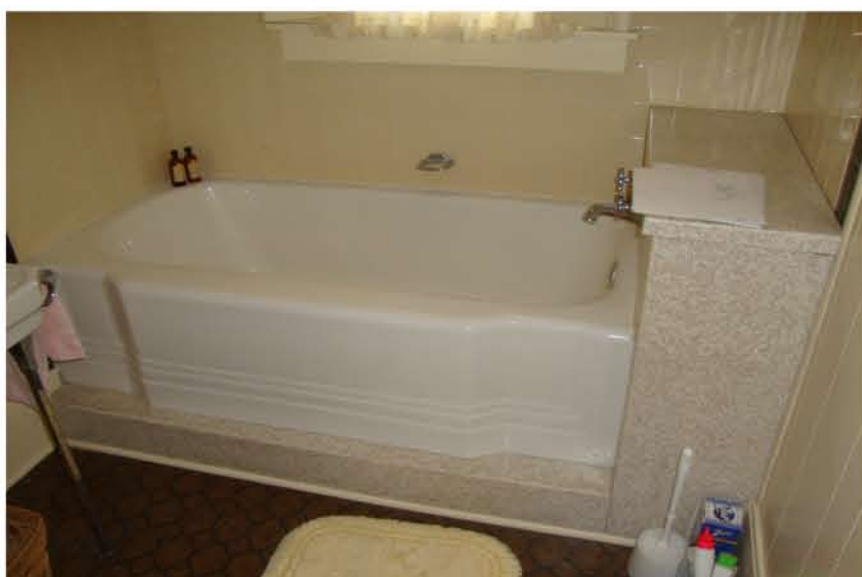
26-BUILDING B - LEVEL 2