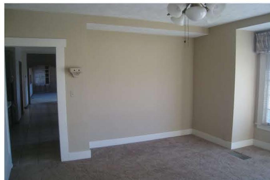
8-BUILDING B - LEVEL 1