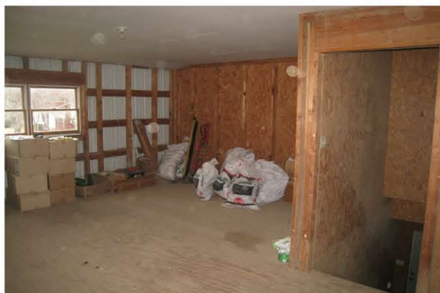
37-BUILDING D - LEVEL 2