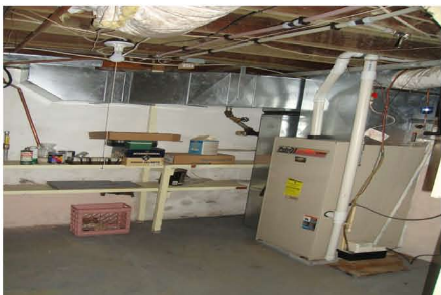
18-BUILDING B - BASEMENT