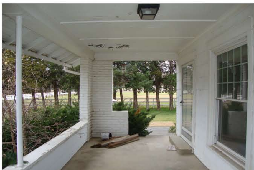
12-BUILDING B - LEVEL 1