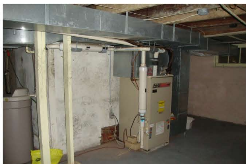
16-BUILDING B - BASEMENT