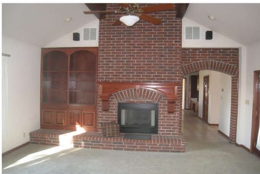
2-BUILDING B - LEVEL 1