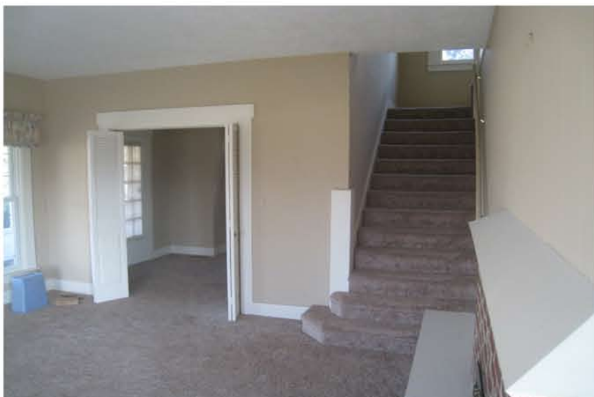
10-BUILDING B - LEVEL 1