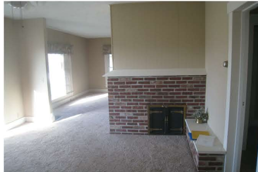
7-BUILDING B - LEVEL 1