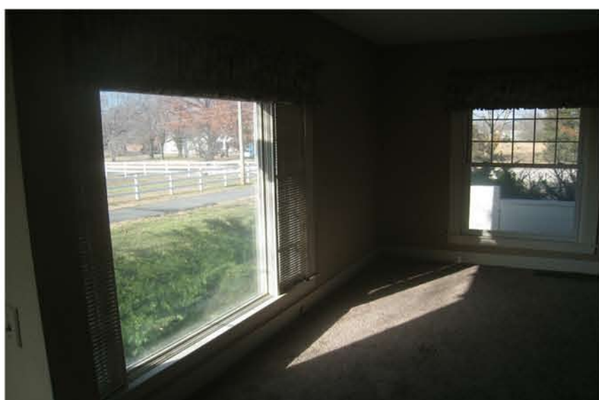
9-BUILDING B - LEVEL 1