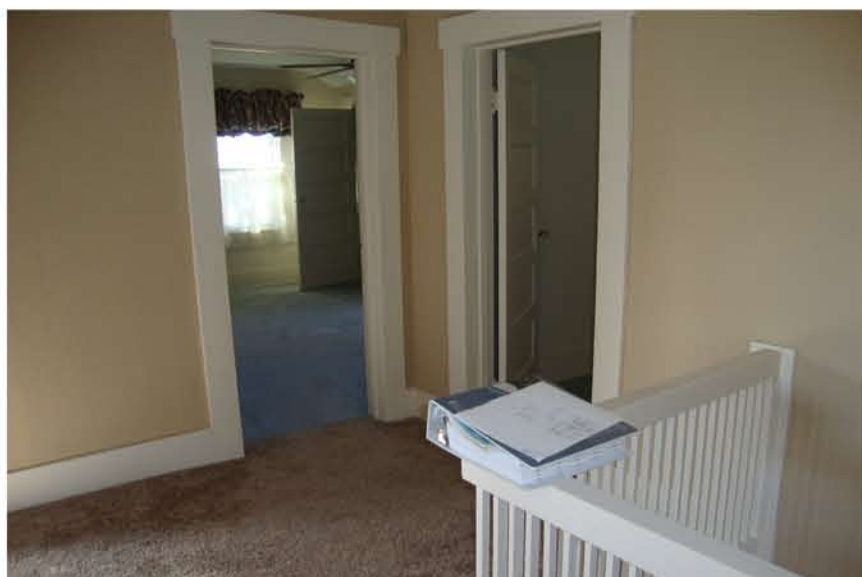
20-BUILDING B - LEVEL 2