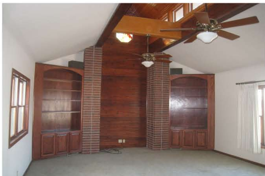
1-BUILDING B - LEVEL 1

one and one half inches = one foot one inch = one foot three quarters inch = one foot one half inch = one foot three eighths inch = one foot one quarter inch = one foot one eighth inch = one foot