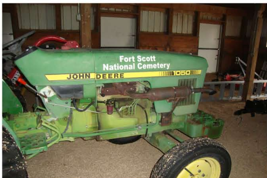
33-BUILDING D - LEVEL 1