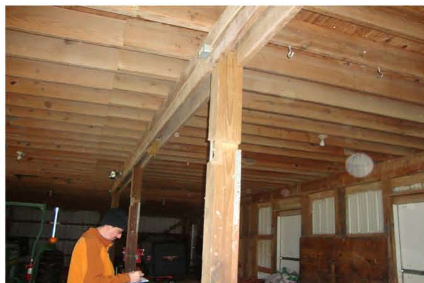
32-BUILDING D - LEVEL 1