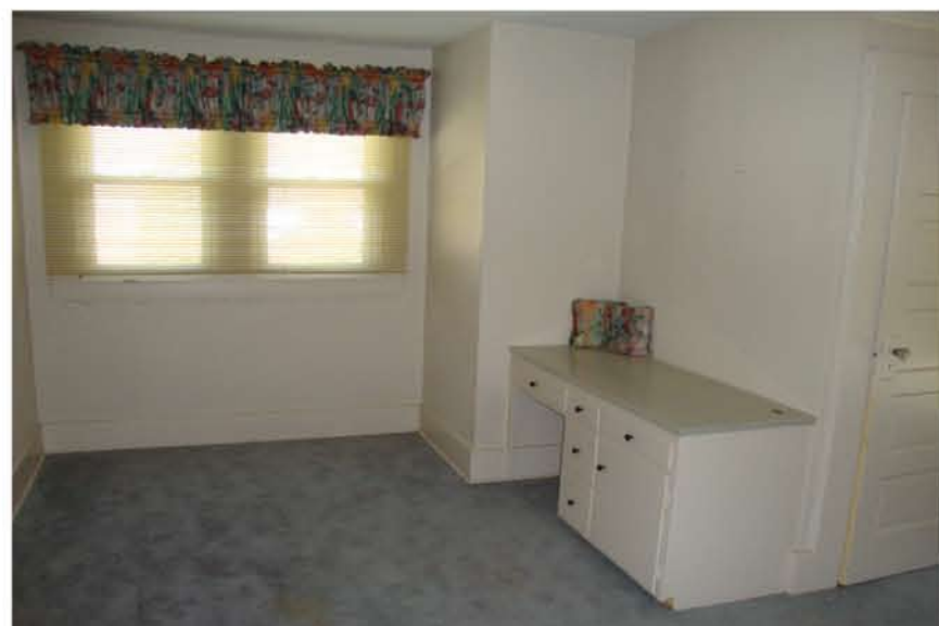
22-BUILDING B - LEVEL 2