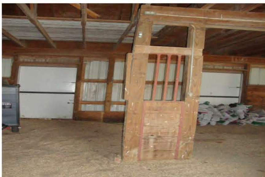
34-BUILDING D - LEVEL 1