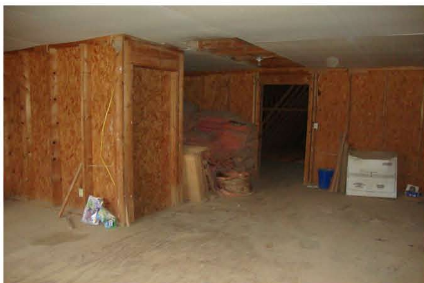
36-BUILDING D - LEVEL 2