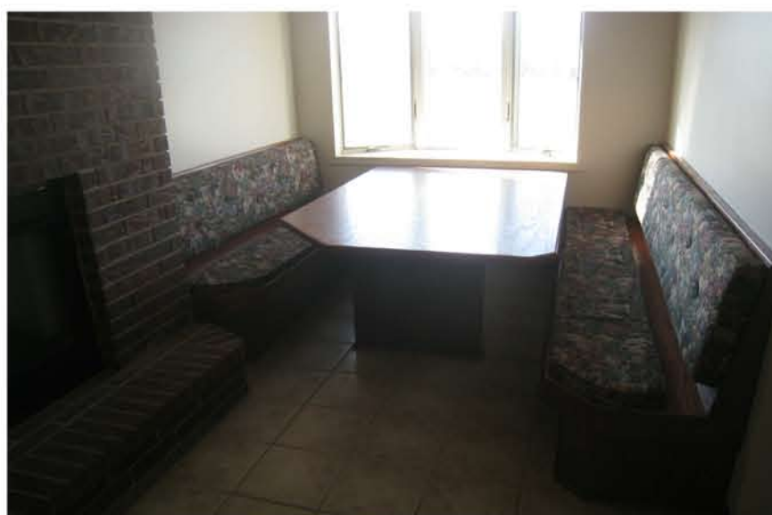
3-BUILDING B - LEVEL 1