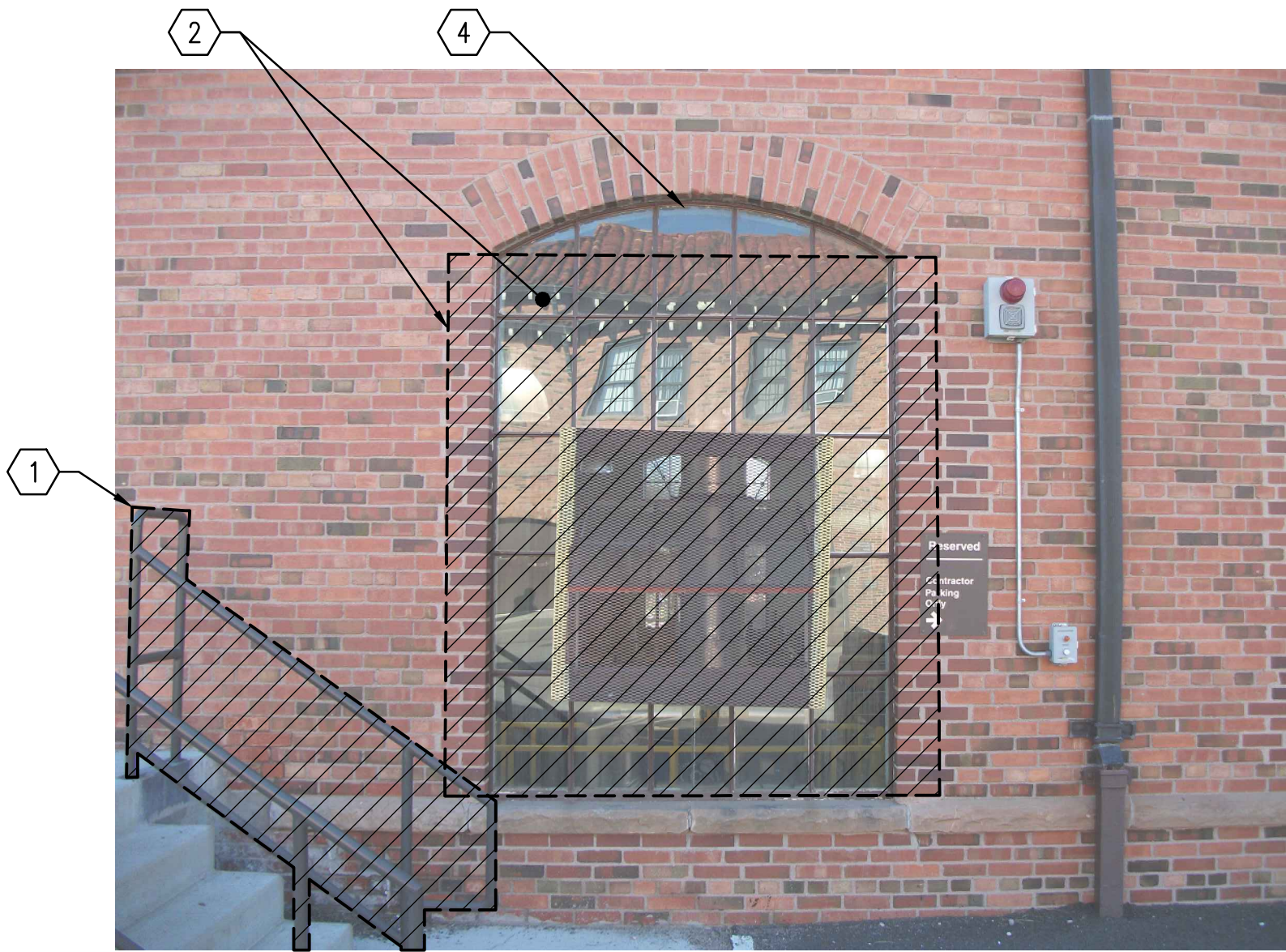
F2 EXISTING SITE PHOTO - BUILDING EXTERIOR WINDOW NOT TO SCALE