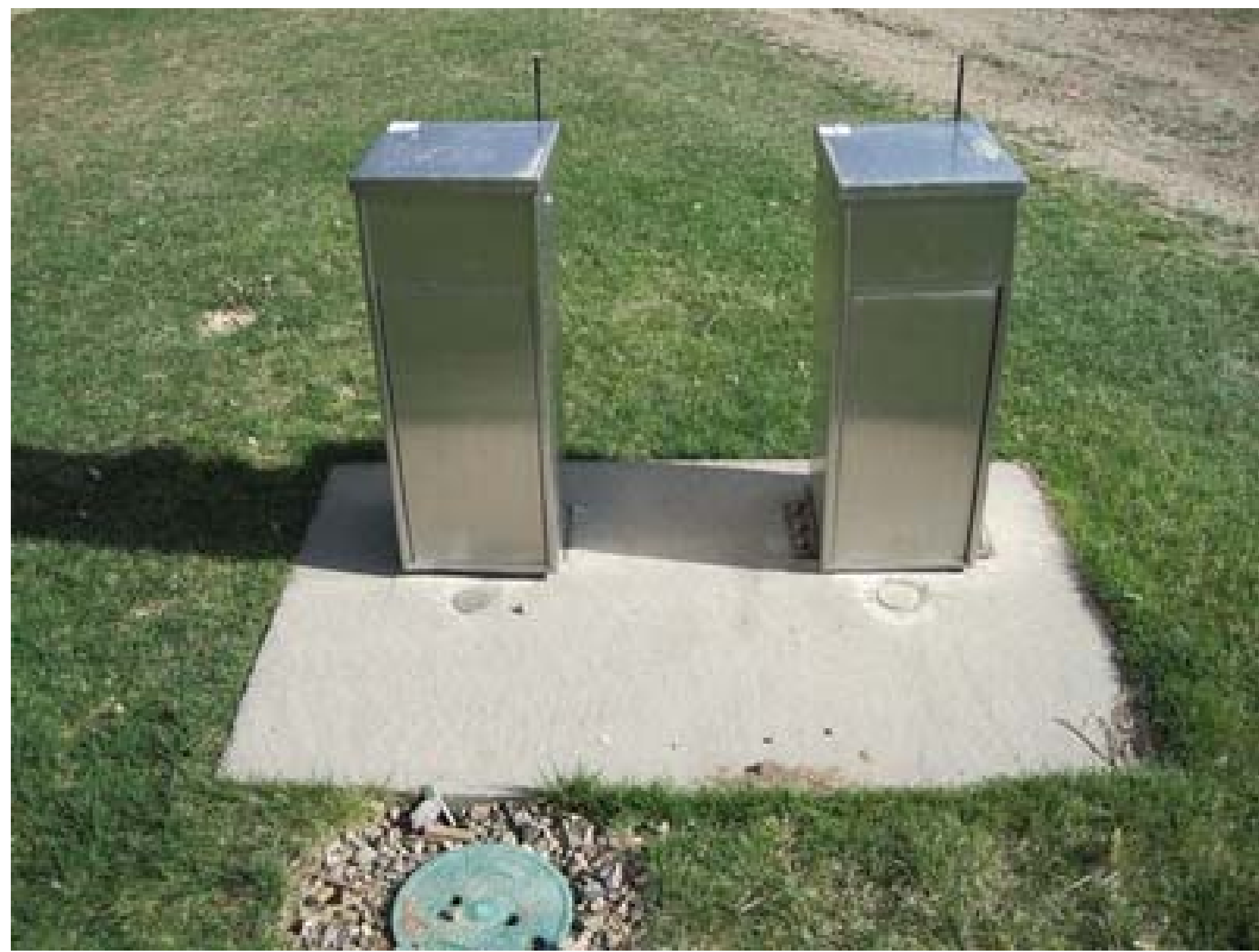
⑯ ⑰ ESP-24SAT-2S, ESP-24SAT-2S