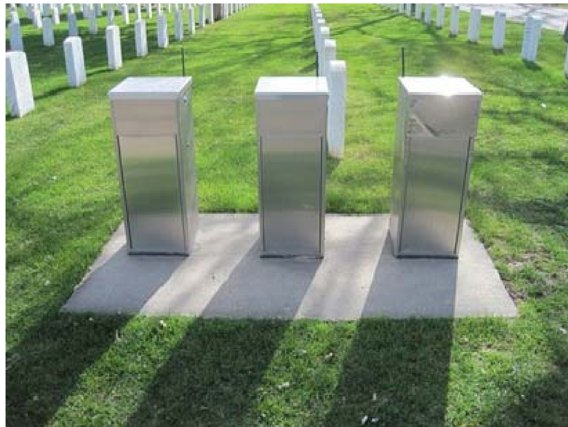
④ ⑤ ⑥ ESP-24SAT-2S, ESP-24SAT-2S, ESP-24SAT-2S