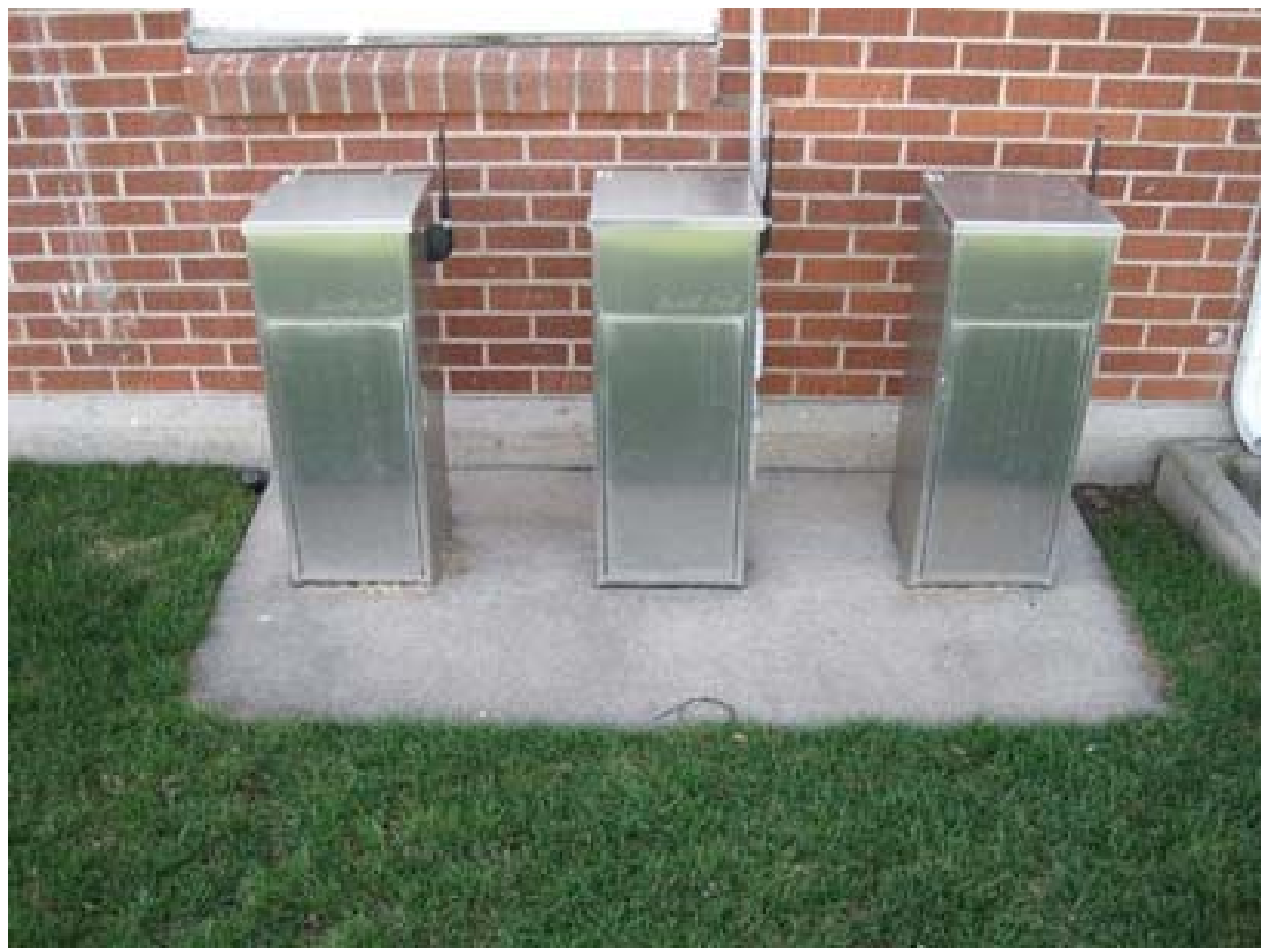
① ② ③ ESP-24SAT-2S, ESP-24SAT-2S, ESP-24SAT-2S