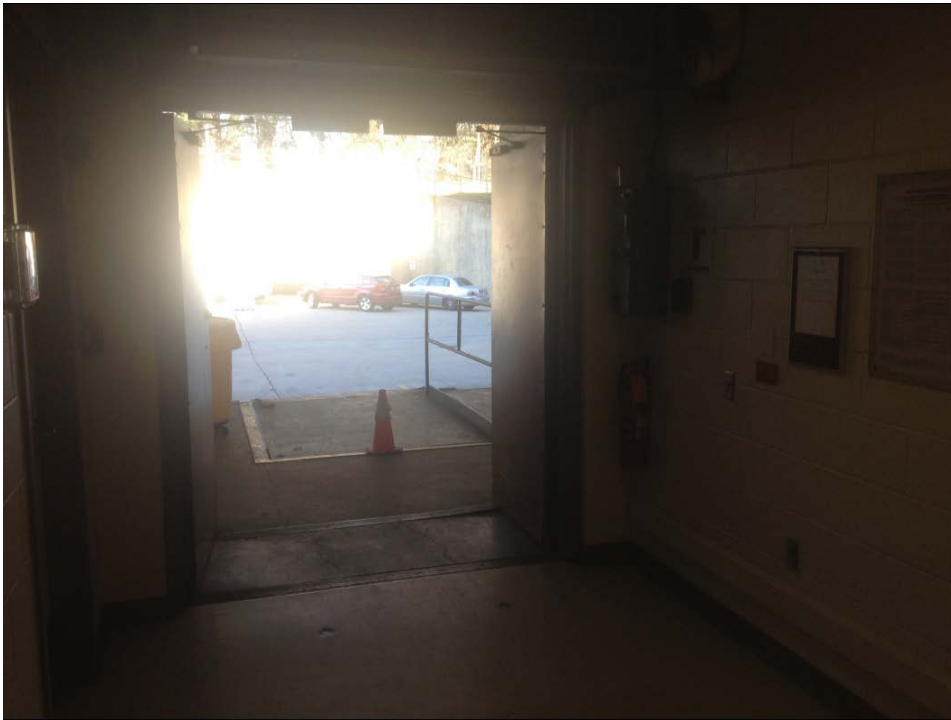
Loading Dock 2 from Inside