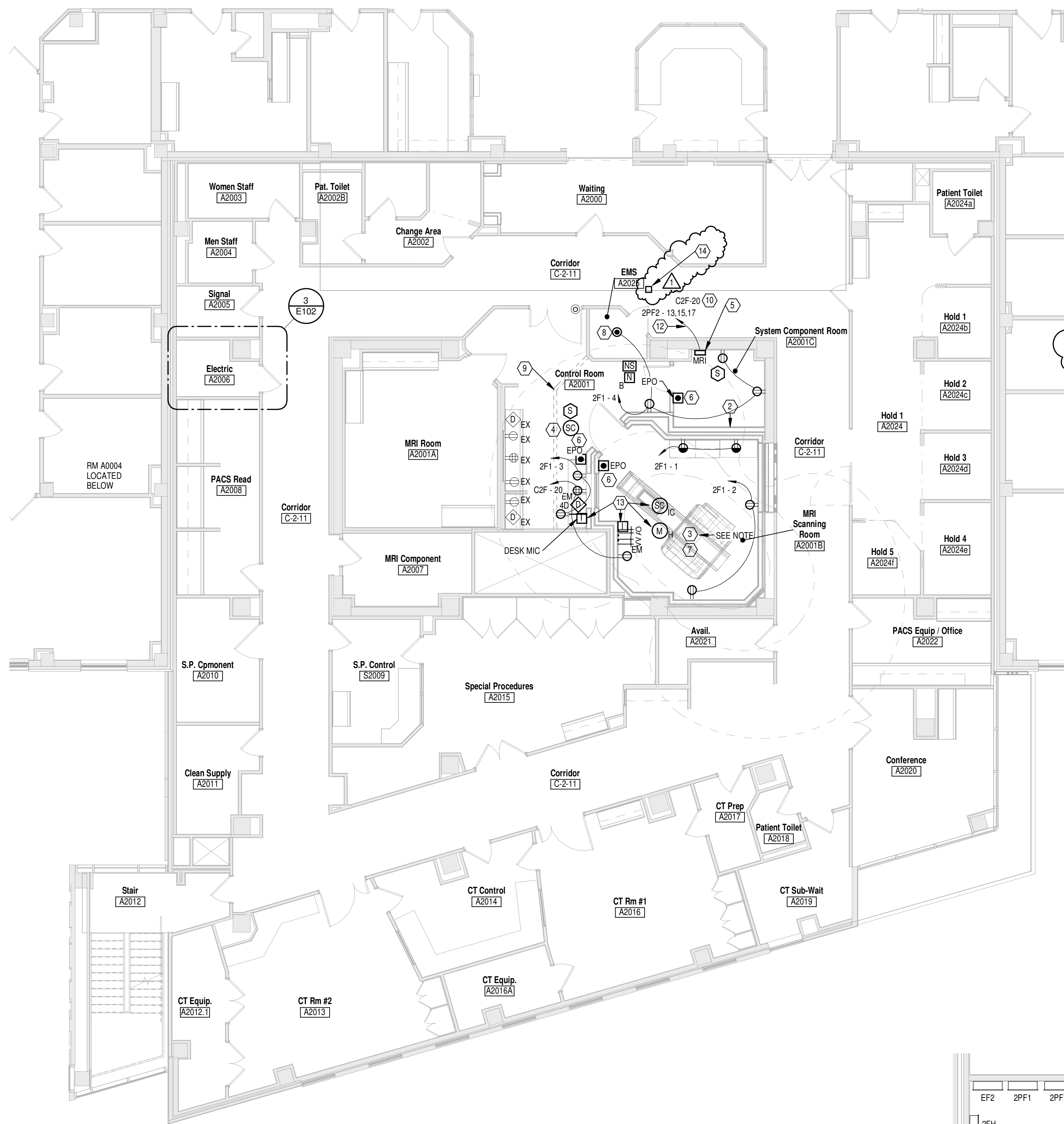
PARTIAL SECOND FLOOR PLAN Scale: 1/8" = 1'-0"