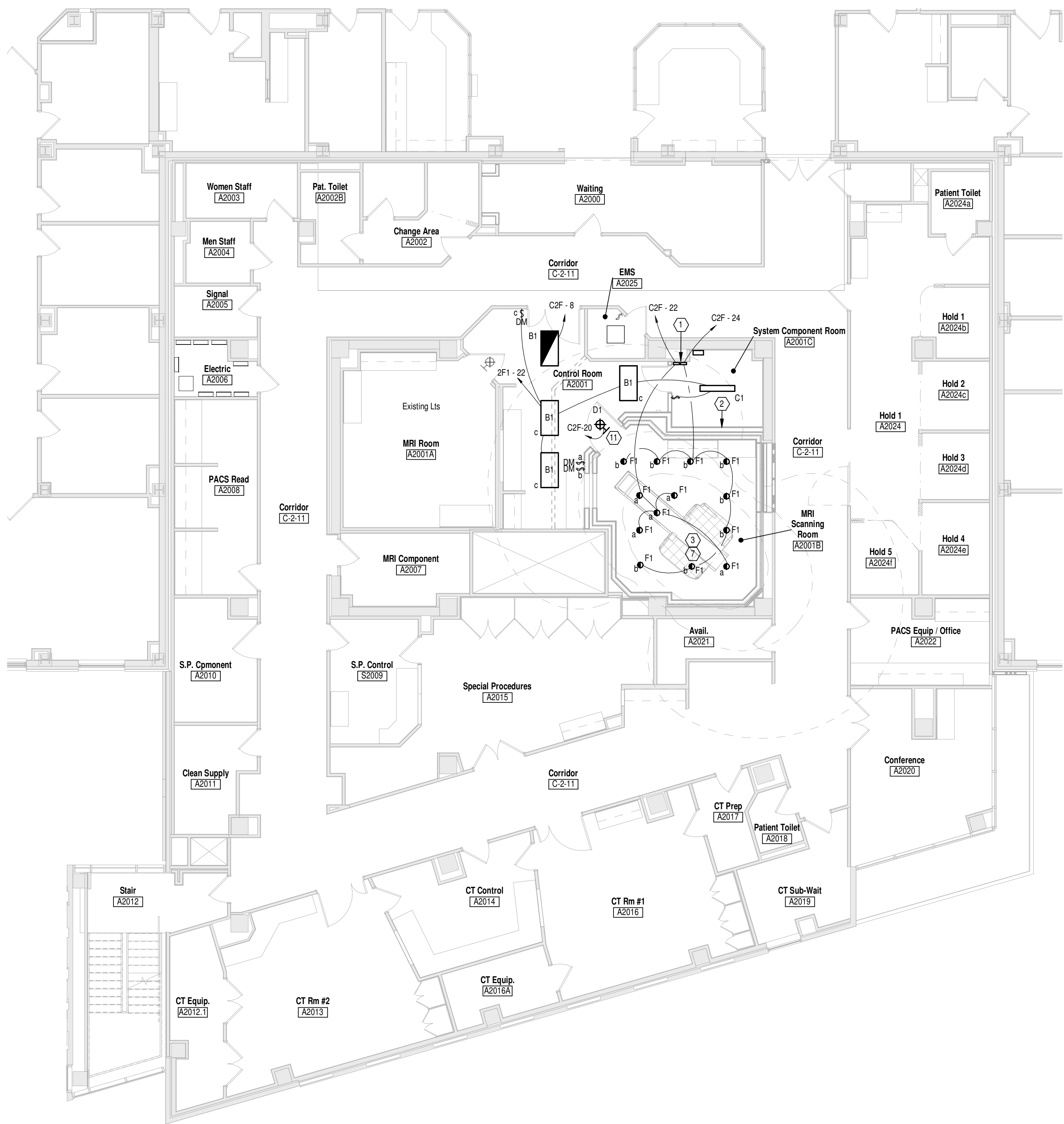
PARTIAL SECOND FLOOR PLAN Scale: 1/8" = 1'-0"