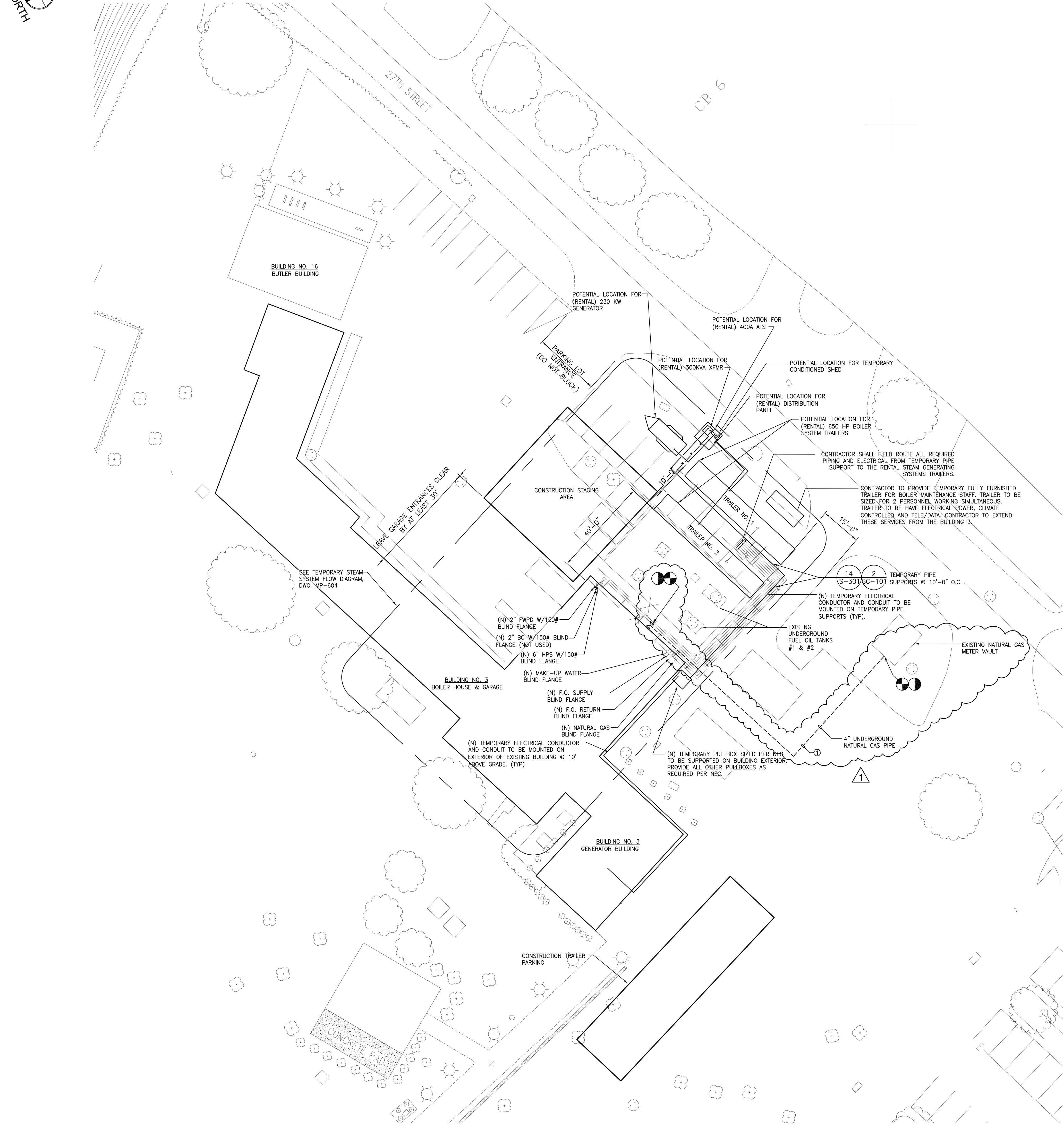
1 SITE PLAN - TEMPORARY BOILER AND EQUIPMENT TRAILERS SCALE: 1" = 20'-0"

P:\0499_DWG\3-0499-0034 Altona Boiler Replacement\2 Drawings\1_Cad\1_Current\Submital Phase\1_Civil & General\GC-101 SITE PLAN.dwg 2-09-16 08:40:24 AM