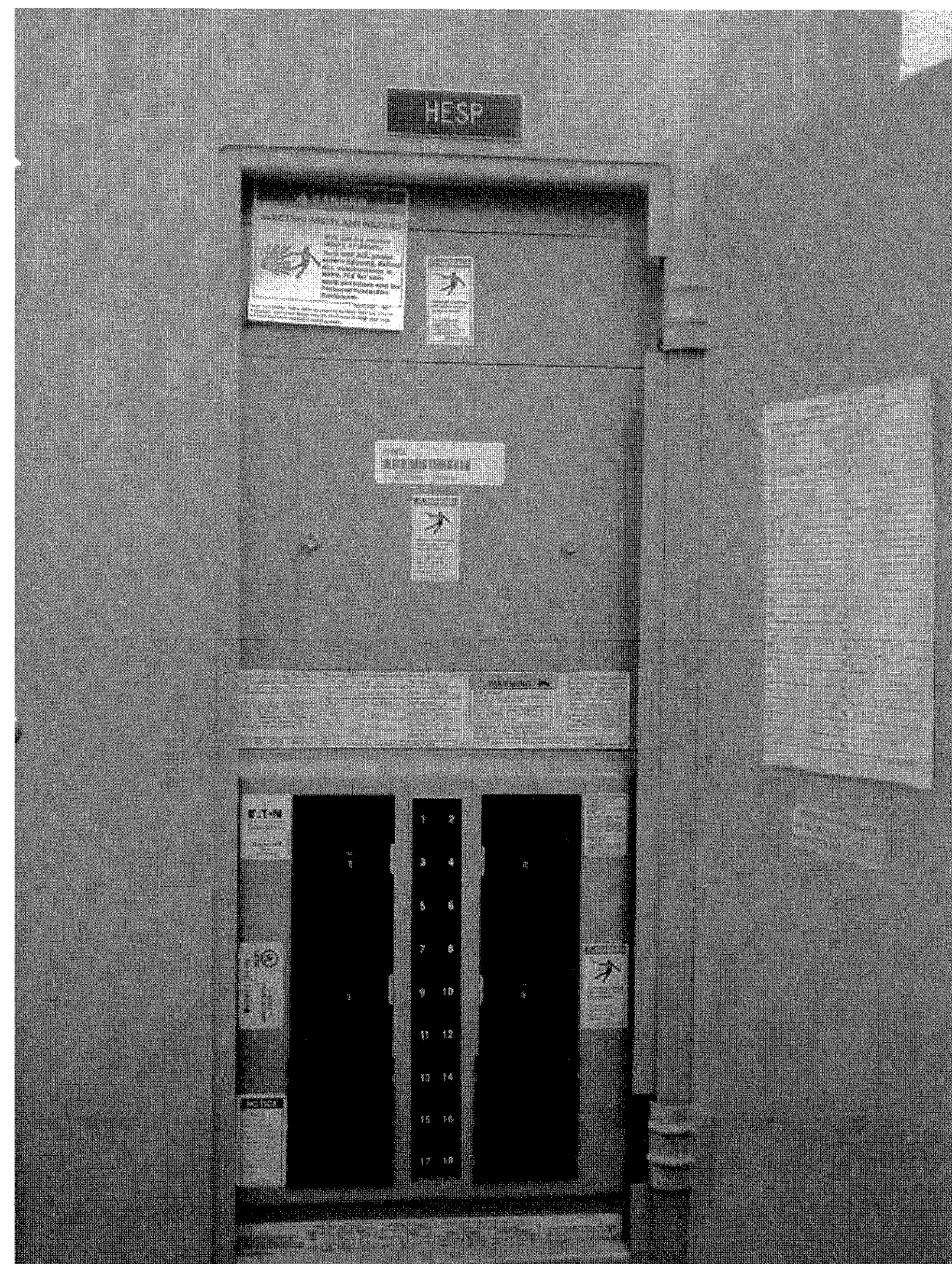
C1 PANEL "HESP" NO SCALE