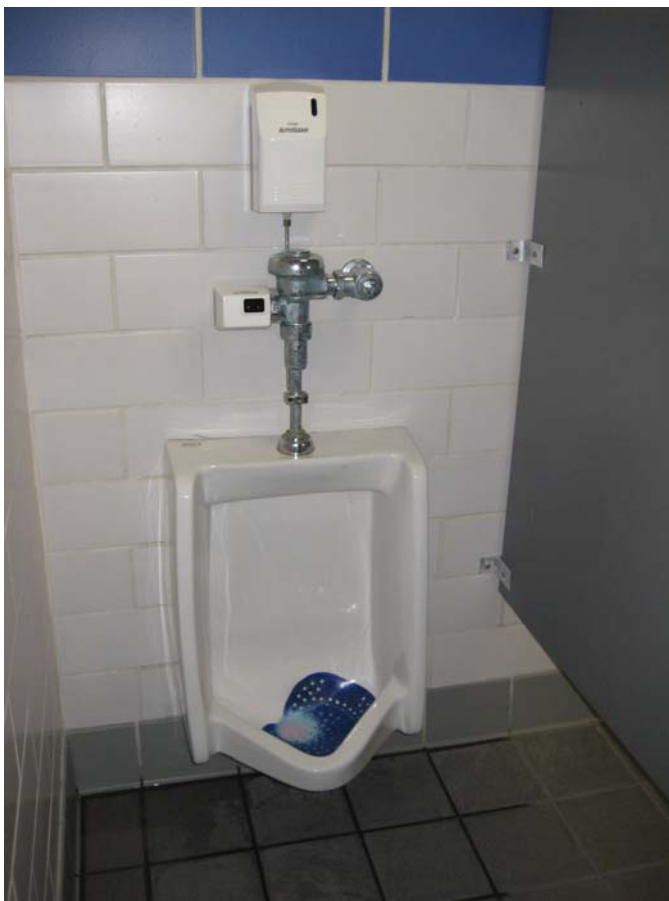
Figure 2: Men's urinal.