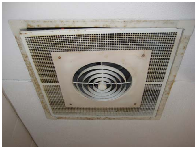
Figure 7: Electric heater register.