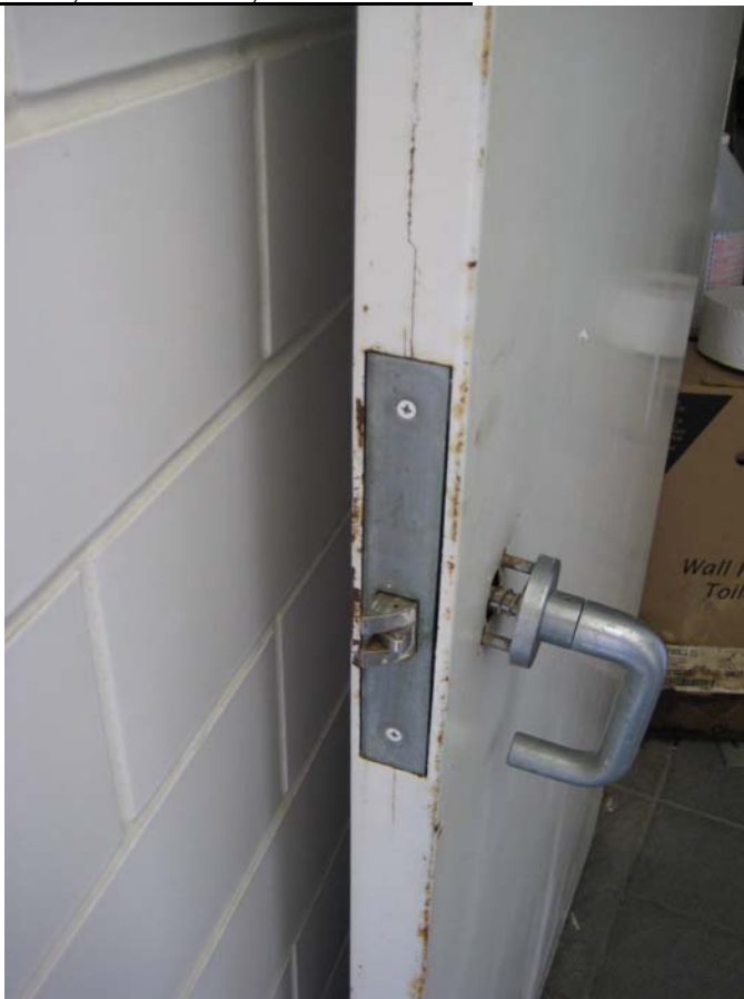
Figure 6: Metal door and hardware.