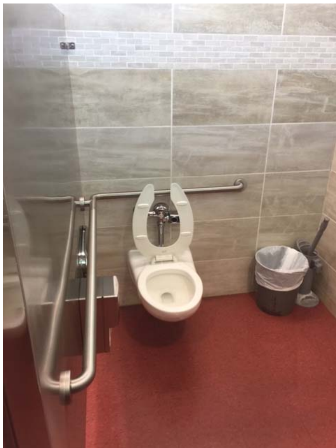
Figure 15: Water closet and accessories.