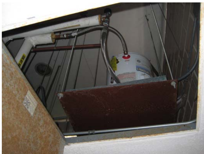
Figure 9: Water heater (above ceiling) and ceiling hatch.