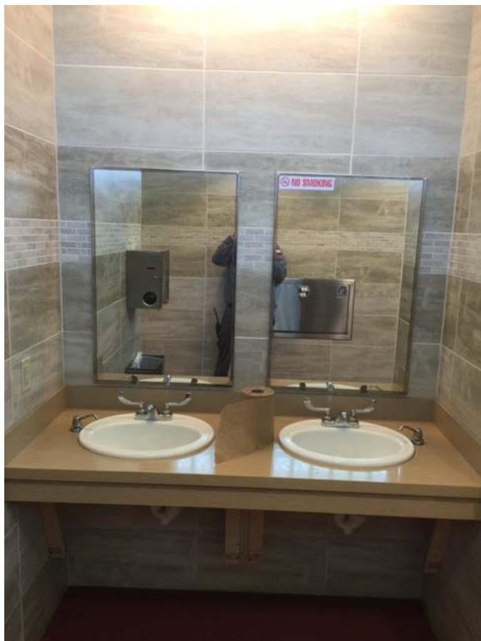
Figure 13: Counter vanity, mirrors, and wall tile.