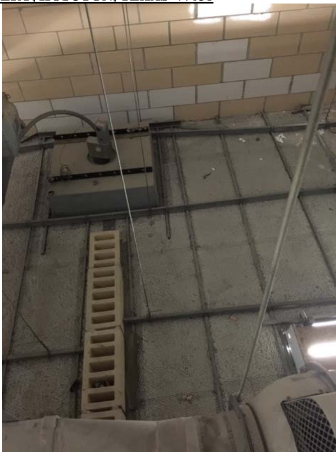
Figure 8: Electric heater (above ceiling).