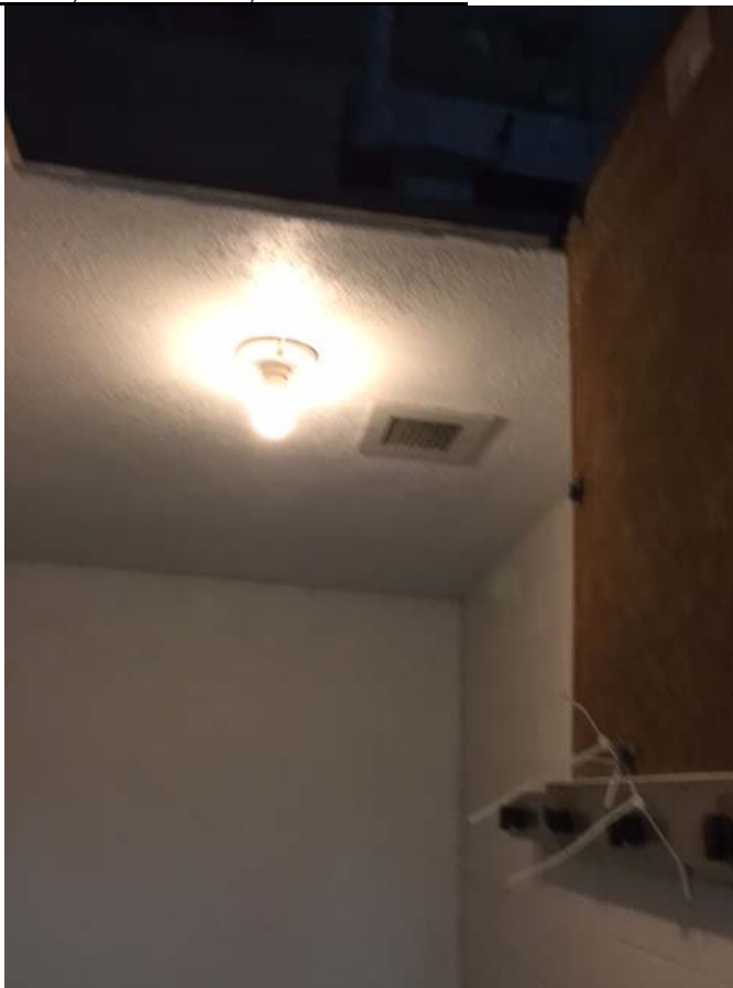
Figure 12: Exhaust ceiling diffuser.