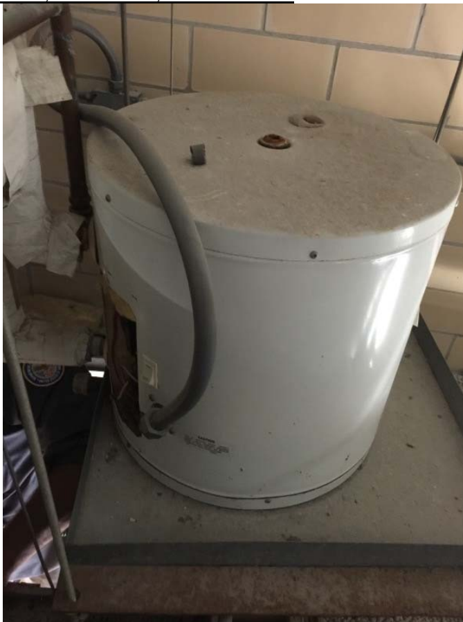
Figure 10: Water heater.