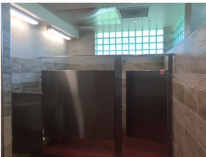
Figure 16: Partitions.