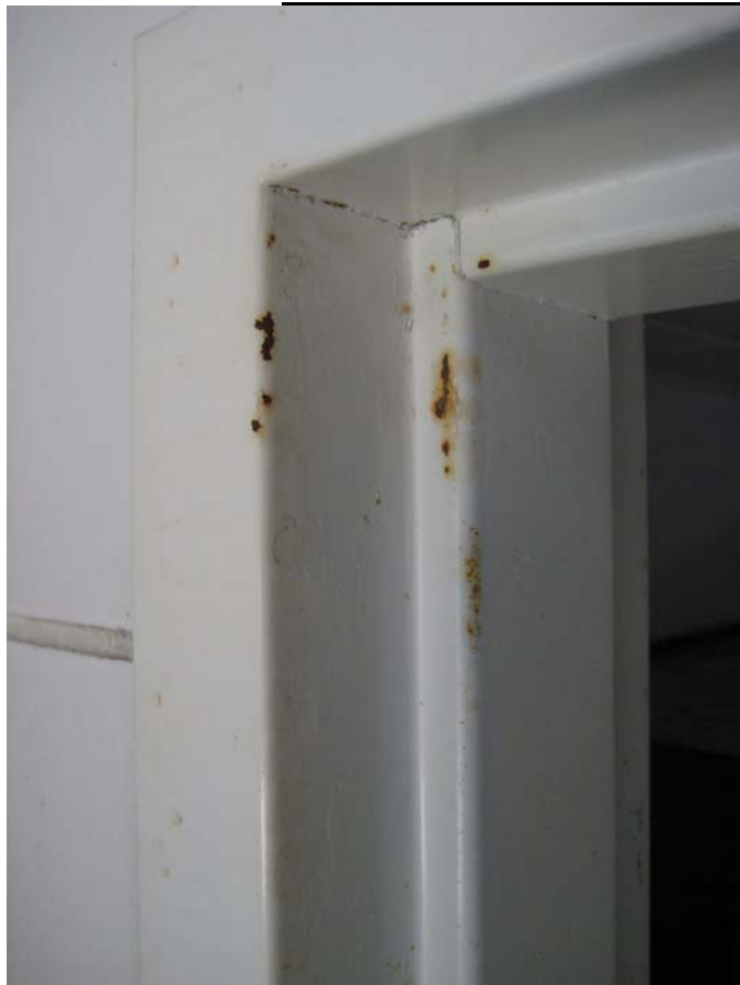
Figure 5: Door frame.