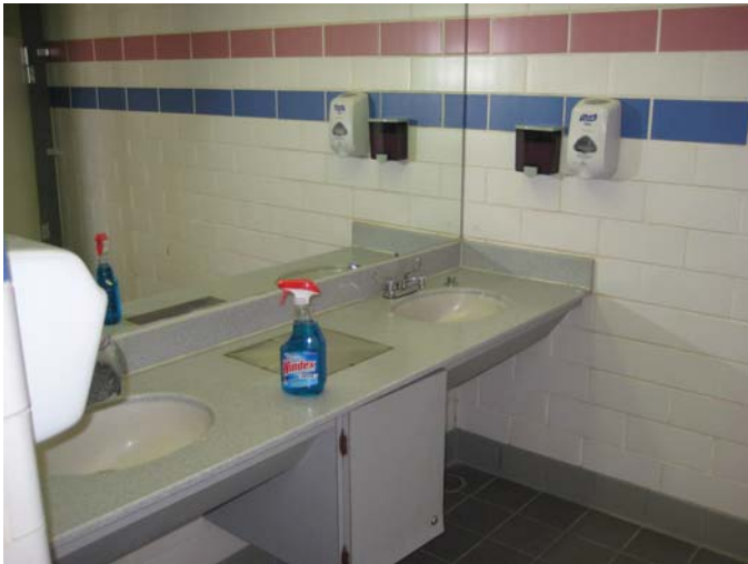
Figure 1: Existing restroom vanity and wall tile.