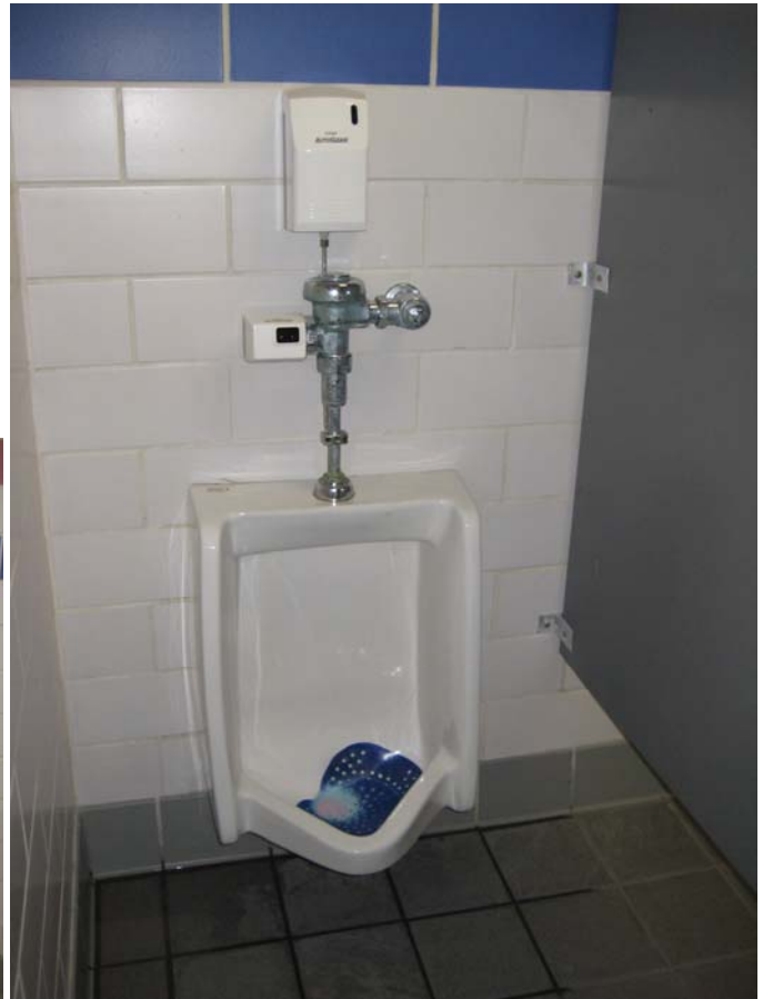
Figure 2: Men's urinal.