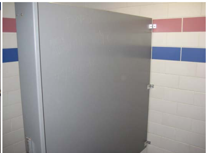
Figure 4: Toilet partition.