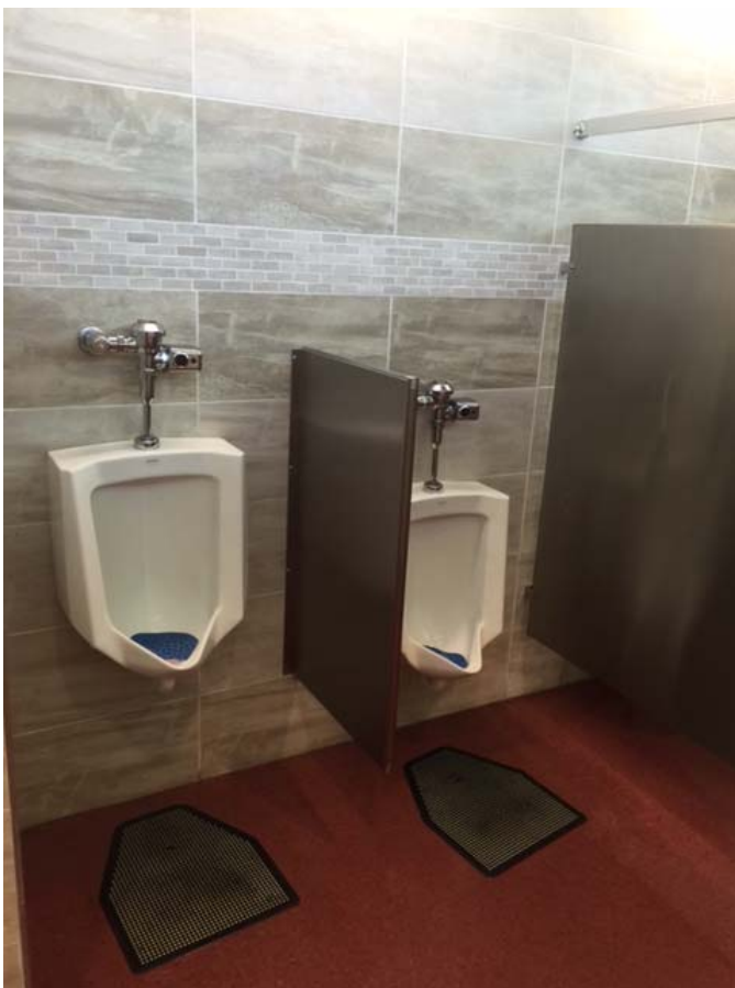
Figure 14: Urinals and floor VCT.