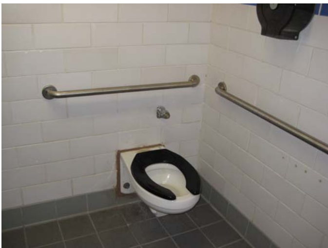
Figure 3: Water closet.