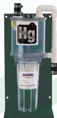
Hg5 Mini 21 1/2" H 11" W 8" D 3/4" Sch 40 PVC inlet & outlet