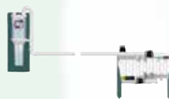
Hg5 installed remote from Otter Tank