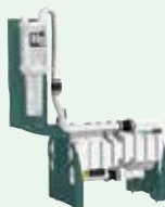
Hg5 attached to Otter Tank with optional mounting bracket