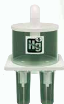
Hg5 HV 28" H 17 5/8" W 22 1/2" D 3" Sch 40 PVC inlet & outlet