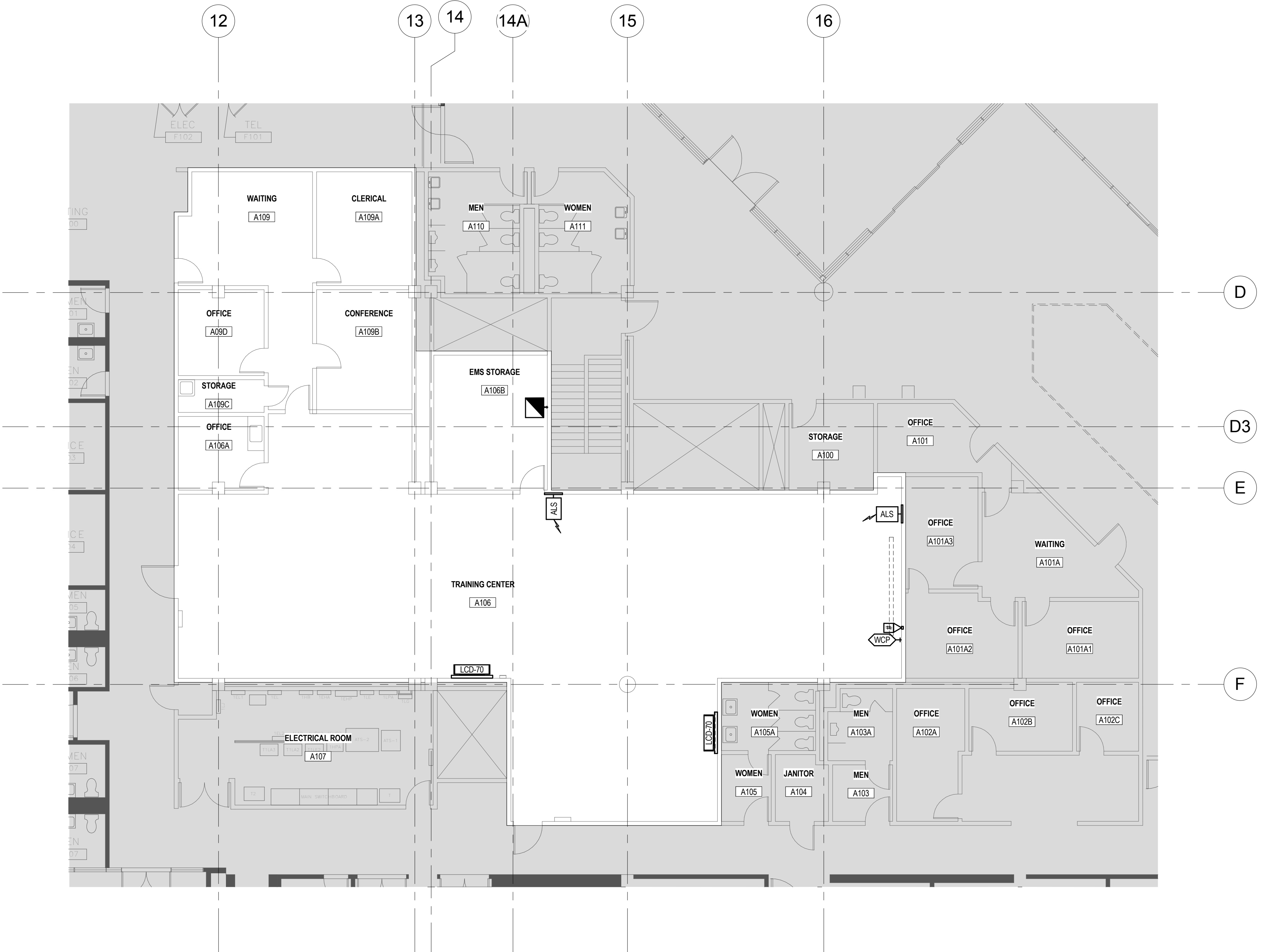
1 AUDIO VISUAL DEVICE PLAN - BLDG 334 LEVEL 1 TRAINING CENTER 1/8" = 1'-0"

100% CD / BID SUBMISSION FEBRUARY 2, 2016