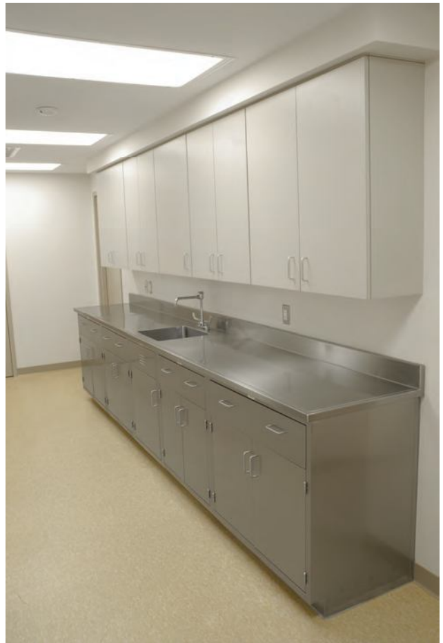
Completed lab with cabinets

Sliding Metal Doors: Doors are constructed similar to the hinged door without hinge reinforcements. Each sliding door is fitted with two grooved nylon sheaves that ride on an aluminum track set in the bottom of the cabinet. The top of each door has two nylon guides to prevent metal-to-metal contact.