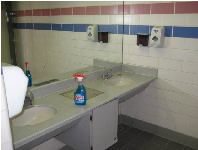
Figure 1: Existing restroom vanity and wall tile.