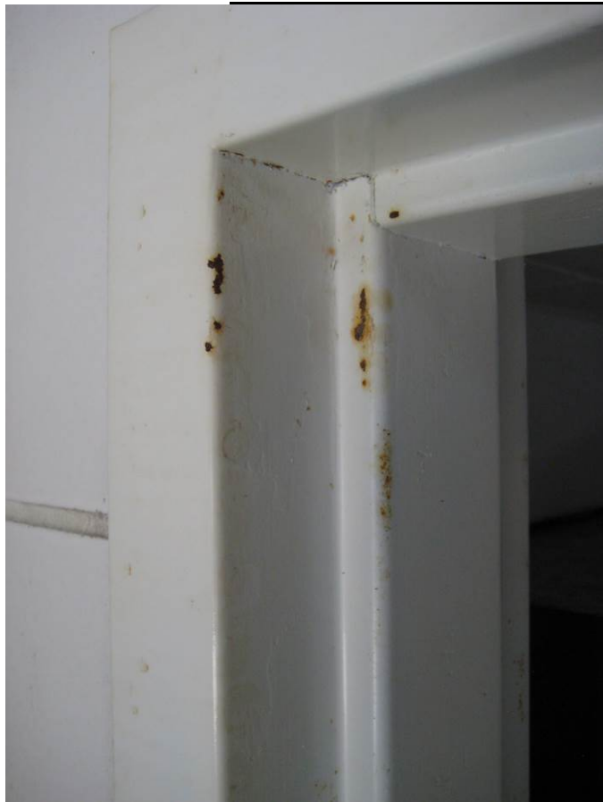
Figure 5: Door frame.