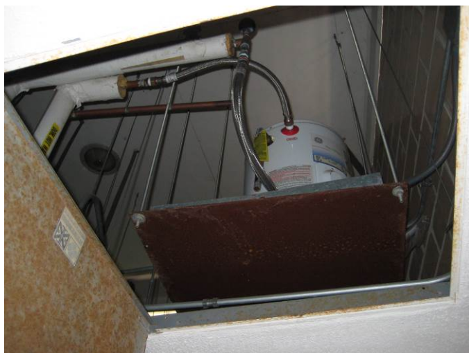
Figure 9: Water heater (above ceiling) and ceiling hatch.