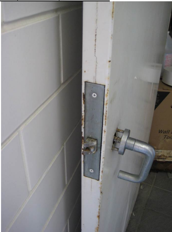
Figure 6: Metal door and hardware.