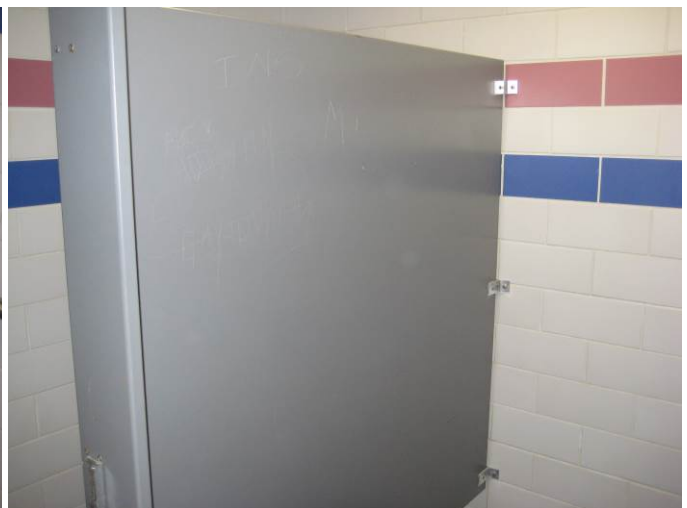
Figure 4: Toilet partition.