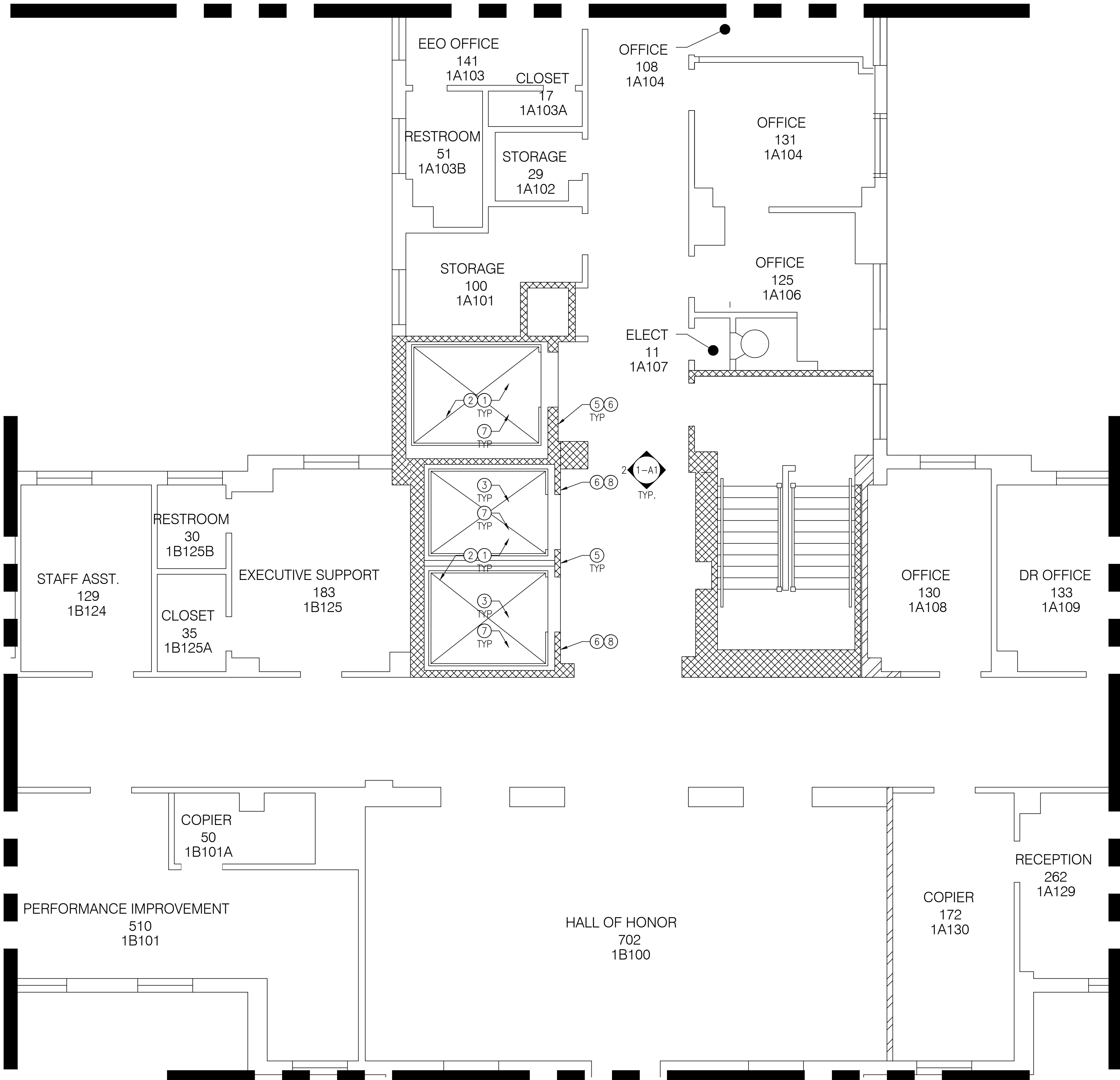
1 BLDG. #1-2ND FLOOR 1/4" = 1'-0"

three inches = one foot one and one half inches = one foot one inch = one foot three quarters inch = one foot one half inch = one foot three eighths inch = one foot one quarter inch = one foot one eighth inch = one foot