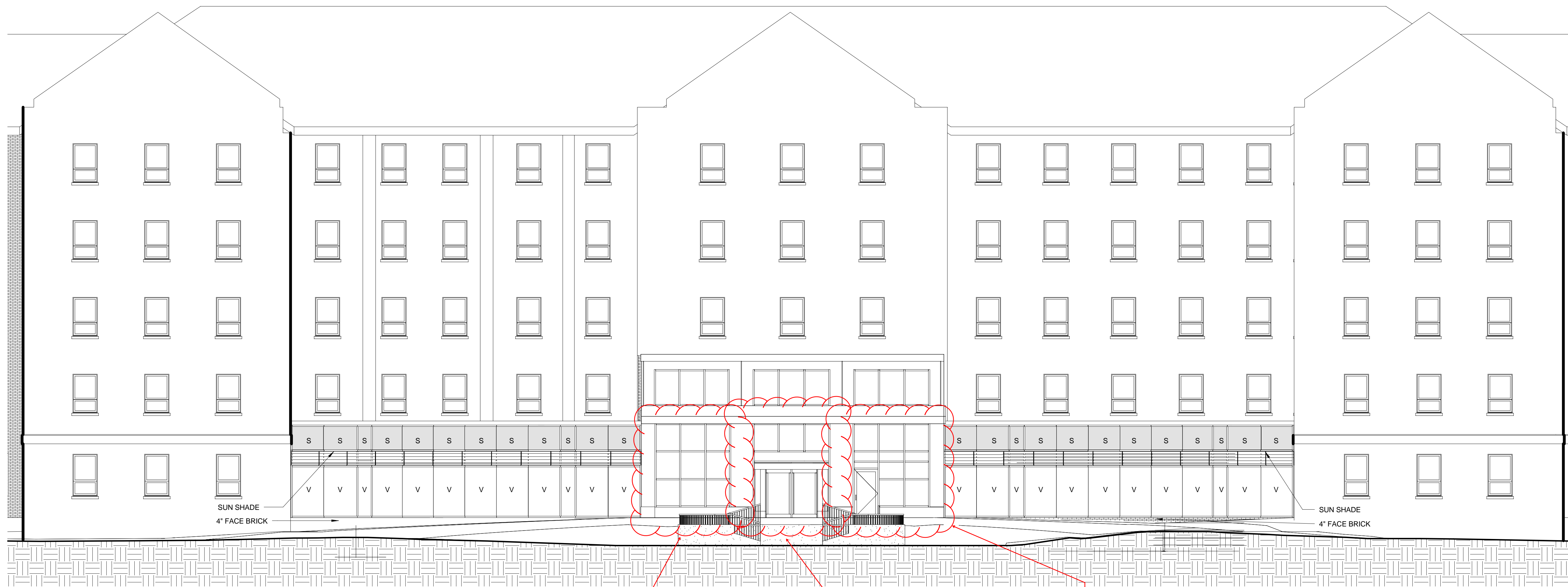
SOUTH BUILDING ELEVATION 1/8" = 1'-0"