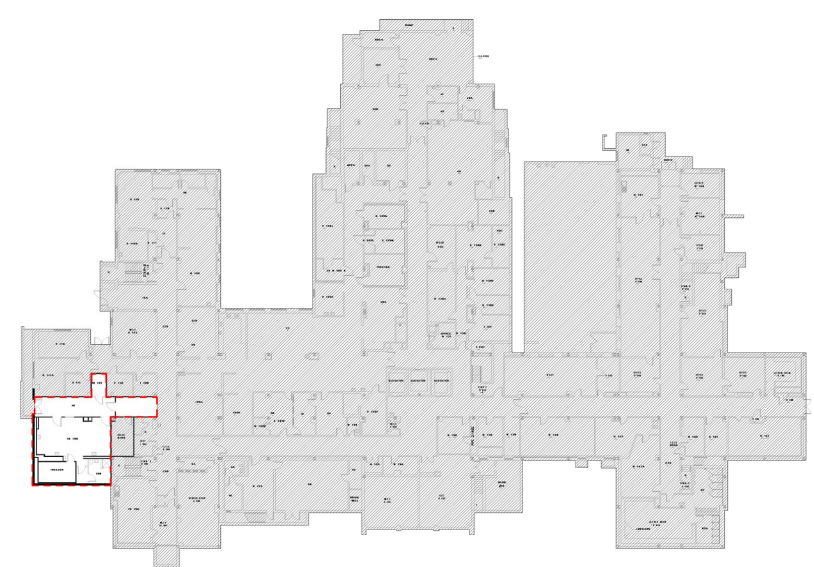
2 00 SUBGRADE FLOOR KEY - NEW 1" = 40'-0"

GENERAL NOTES: ALL EXISTING AND NEW PENETRATIONS CREATED DURING DEMOLITION AND CONSTRUCTION "MUST" BE FIRE STOPPED BY THE END OF THE WORK DAY. PROVIDE SMOKE SEALANTS AROUND ALL PENETRATION IN MECHANICAL ROOM CONTRACTOR TO PROVIDE VAMC APPROVED RENOVATED AREA SIGNAGE TO MATCH FIRST FLOOR. REPAIR DEMOLISHED SLABS TO LIKE NEW CONDITIONS PROVIDE BLOCKING BEHIND ALL AREAS REQUIRING MARKER BOARDS, FILM BOXES, ETC. SEE BLOCKING SPECIFICATIONS AND DETAIL PER SHEET AS401 CONTRACTOR TO PURCHASE AND INSTALL NEW BODY LIFT CONTRACTOR SHALL BE RESPONSIBLE FOR ALL PATCHWORK SEE OR UNFORSEEN IN THE SCOPE OF WORK TO INSURE PROPER COMPLETION OF THE JOB