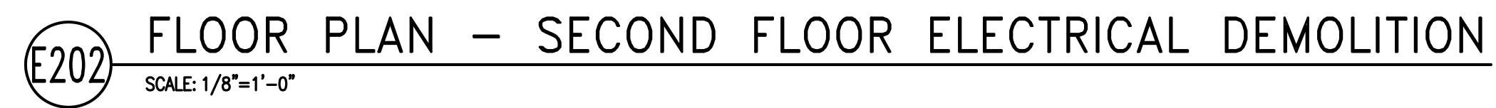
E202 FLOOR PLAN – SECOND FLOOR ELECTRICAL SCALE: 1/8"=1'-0"