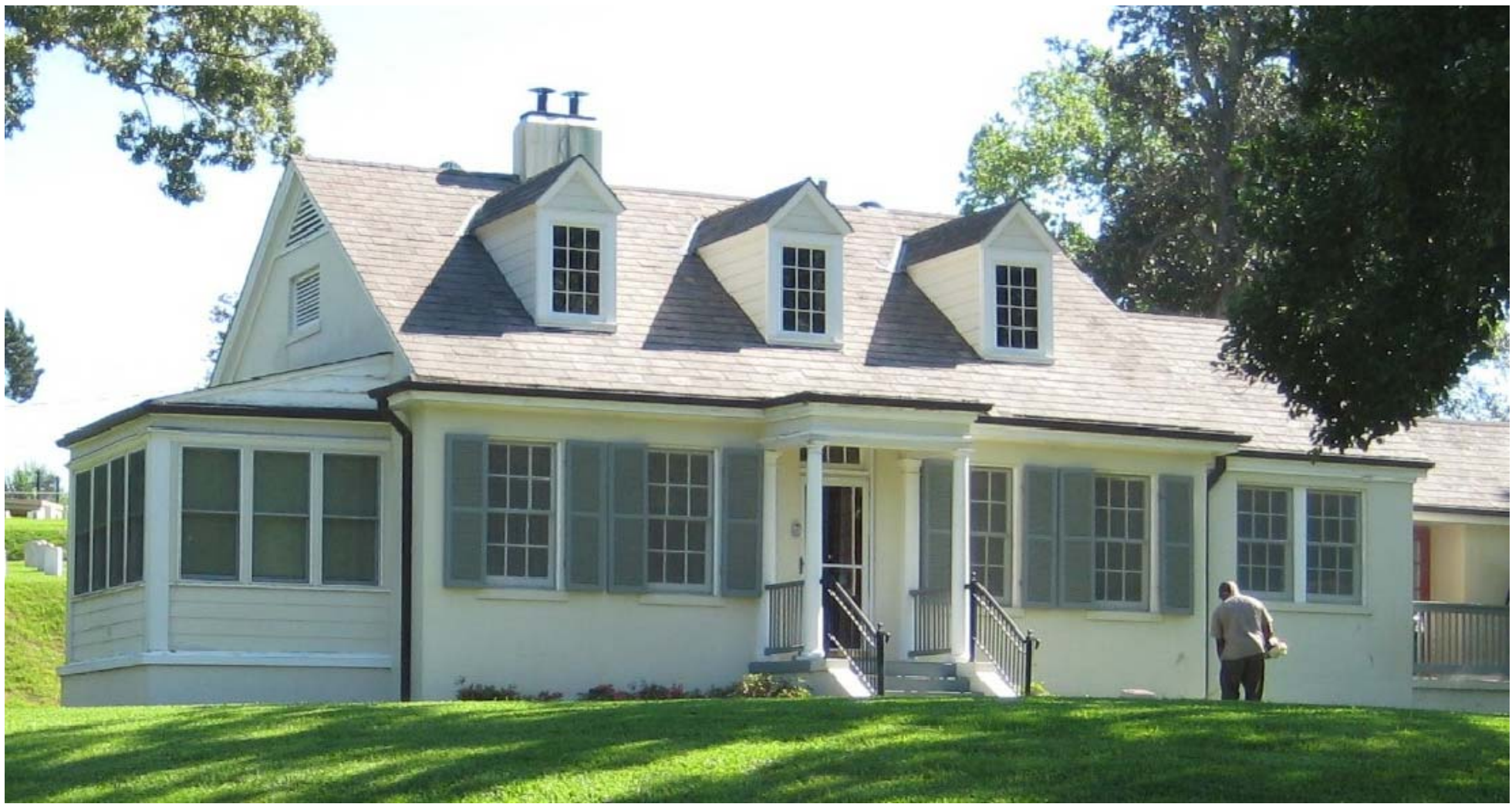
4B PHOTO - FRONT ELEVATION L-1 SOUTHWEST LOOKING NORTHEAST