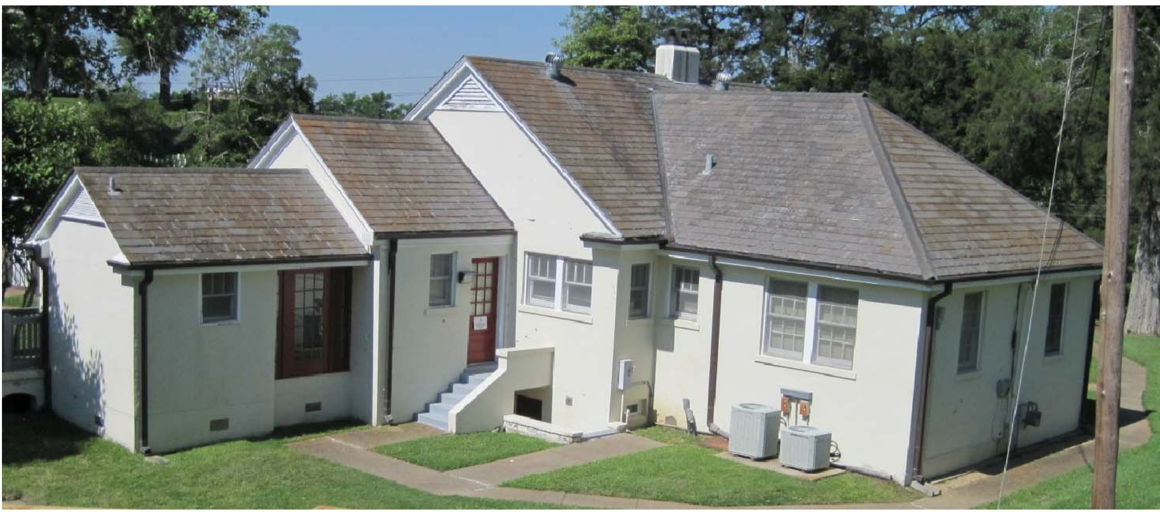
8B PHOTO - REAR ELEVATION L-1 NORTHEAST LOOKING SOUTHWEST