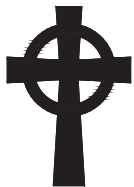
(46) CATHOLIC CELTIC CROSS