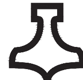
(55) HAMMER OF THOR