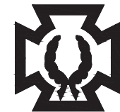
(50) CONFEDERATE (SOUTHERN CROSS OF HONOR)