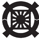
(56) UNIFICATION CHURCH