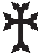
(42) ARMENIAN CROSS