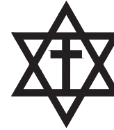
(44) MESSIANIC JEWISH