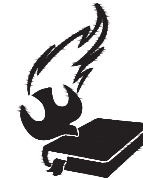
(54) CHURCH OF NAZARENE