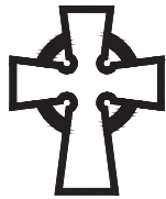
(41) CELTIC CROSS