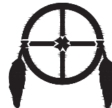
(53) FOUR DIRECTIONS