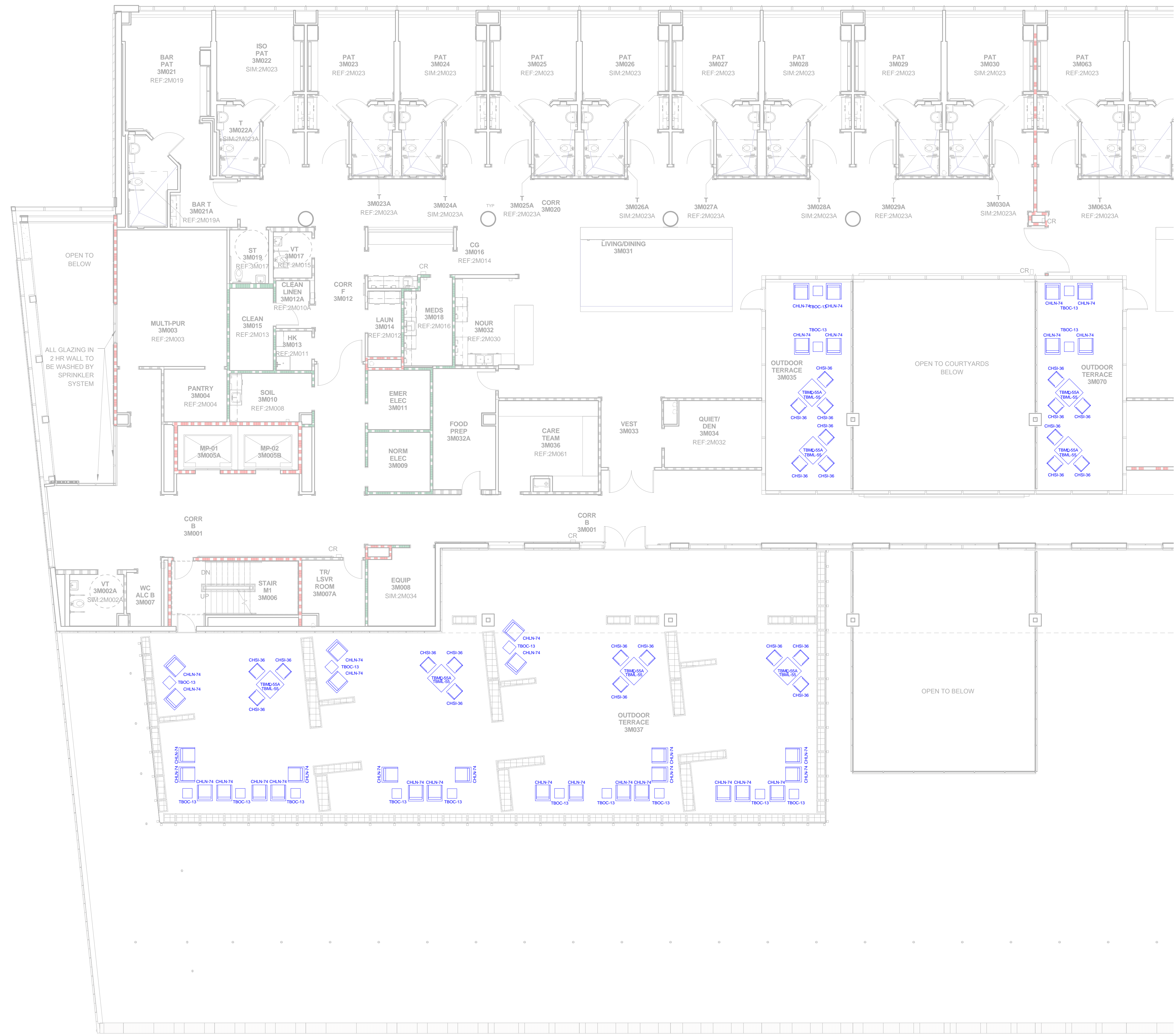
3rd Floor Furniture Plan - Area M1 1/8" = 1'-0"