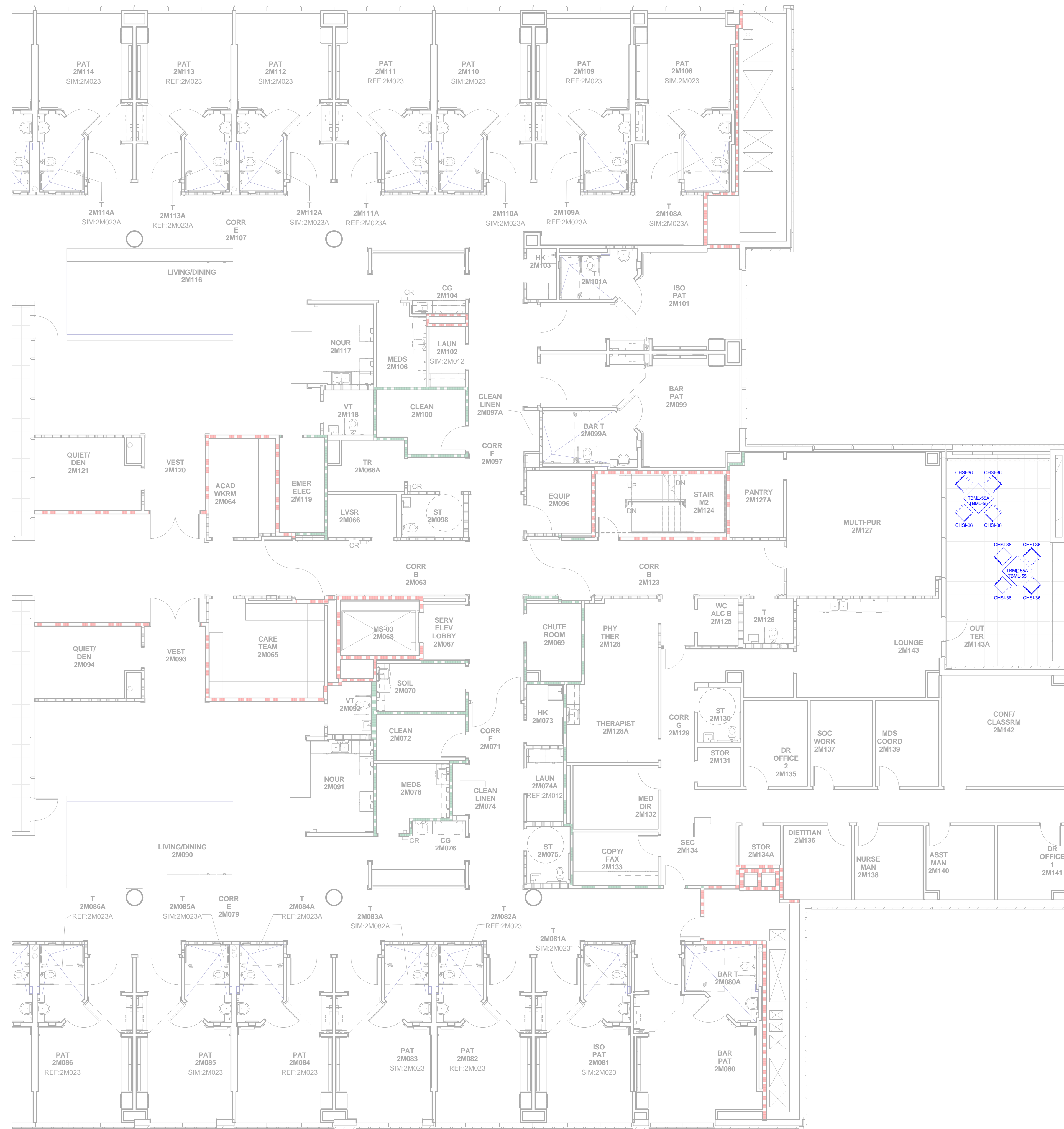
1 2nd Floor Furniture Plan - Area M2 1/8" = 1'-0"