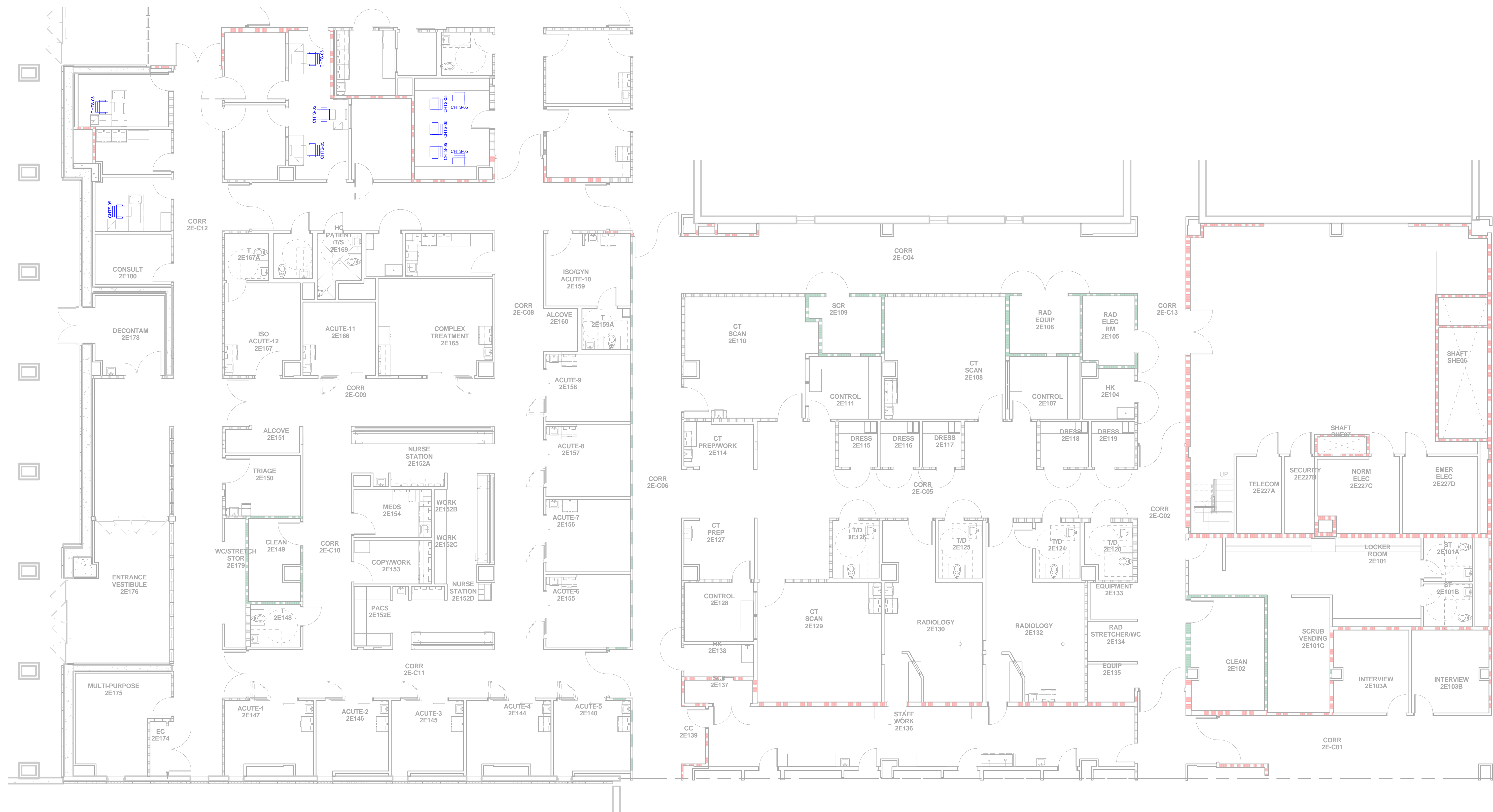
1 2nd Floor Furniture Plan - Area 2E SCALE: 1/8" = 1'-0"