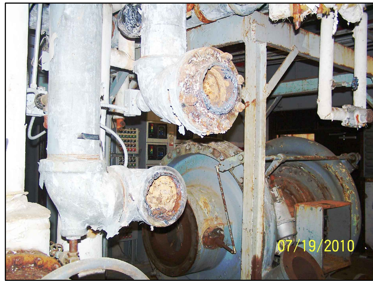
2 P3.1 ABANDONED LINES NOT TO SCALE