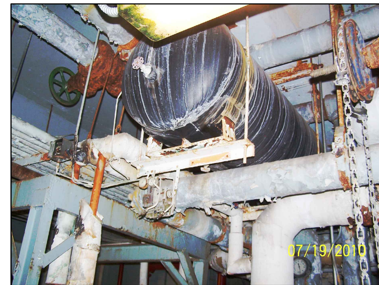
8 P3.1 EXIST. EXPANSION TANK NOT TO SCALE