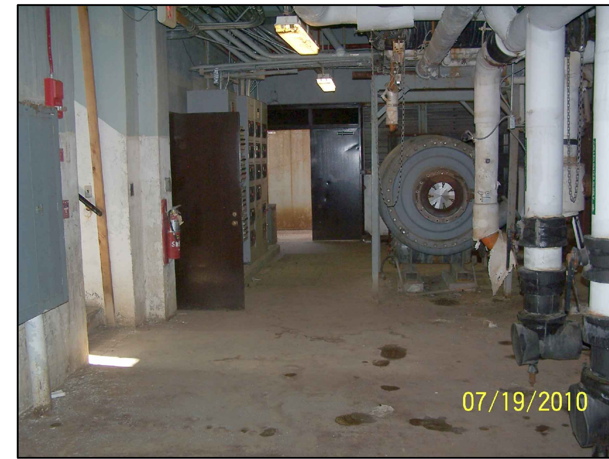
4 P3.1 EXIST. ELECTRICAL PANELS NOT TO SCALE