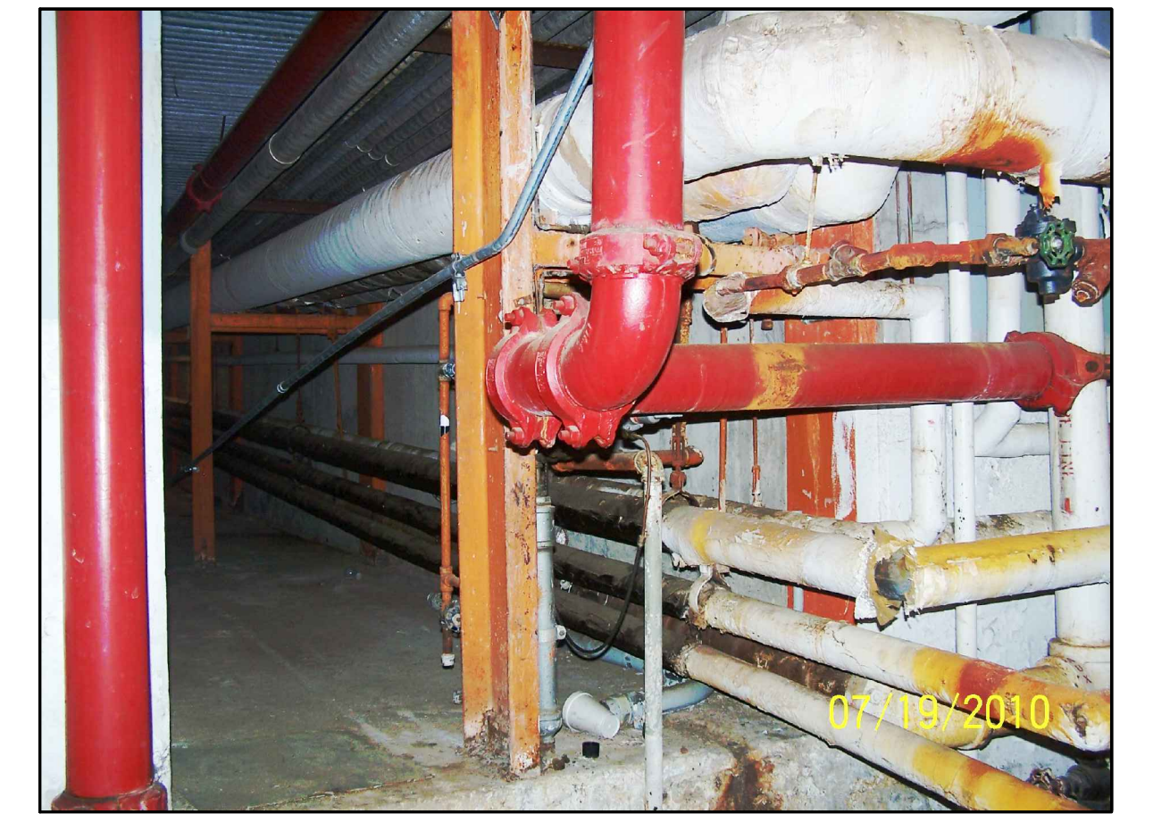
5 P3.1 EXIST. UTILITY TRENCH NOT TO SCALE