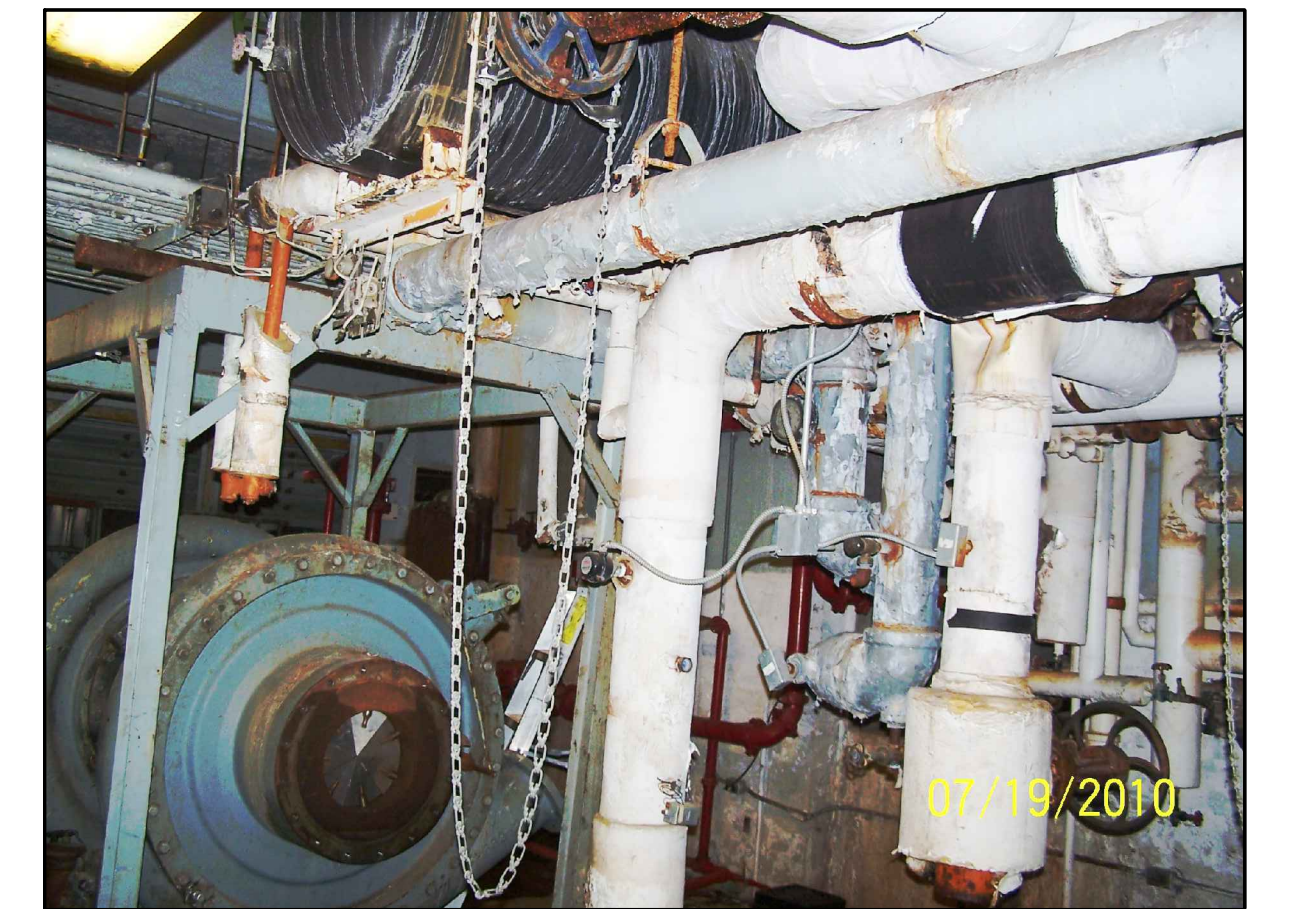
6 P3.1 ABANDONED LINES AND CHILLER NOT TO SCALE