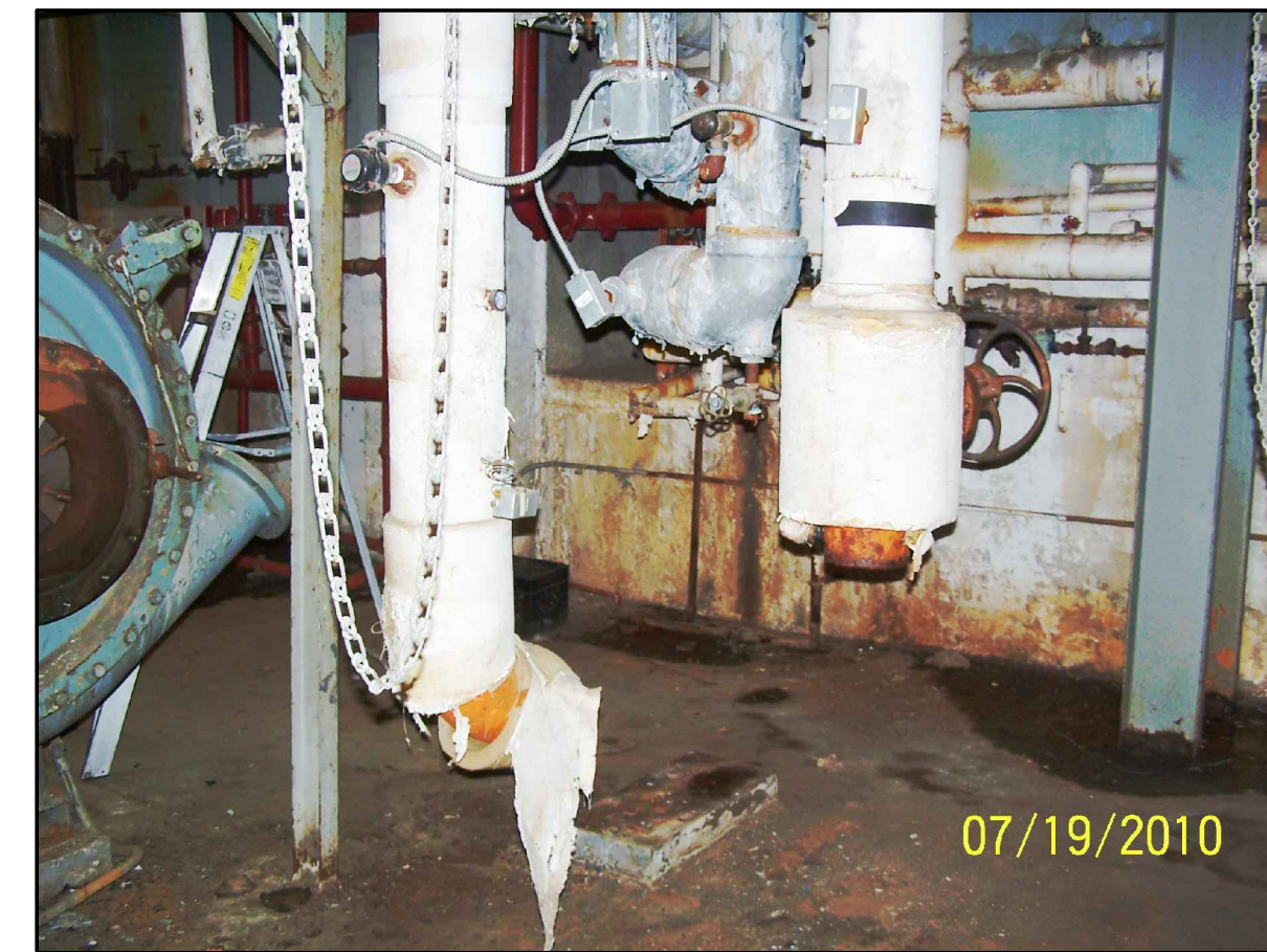
6 P3.1 ABANDONED LINES NOT TO SCALE