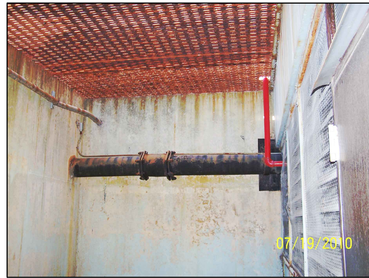
3 P3.1 EXIST. FIRE SPRINKLER LINE NOT TO SCALE