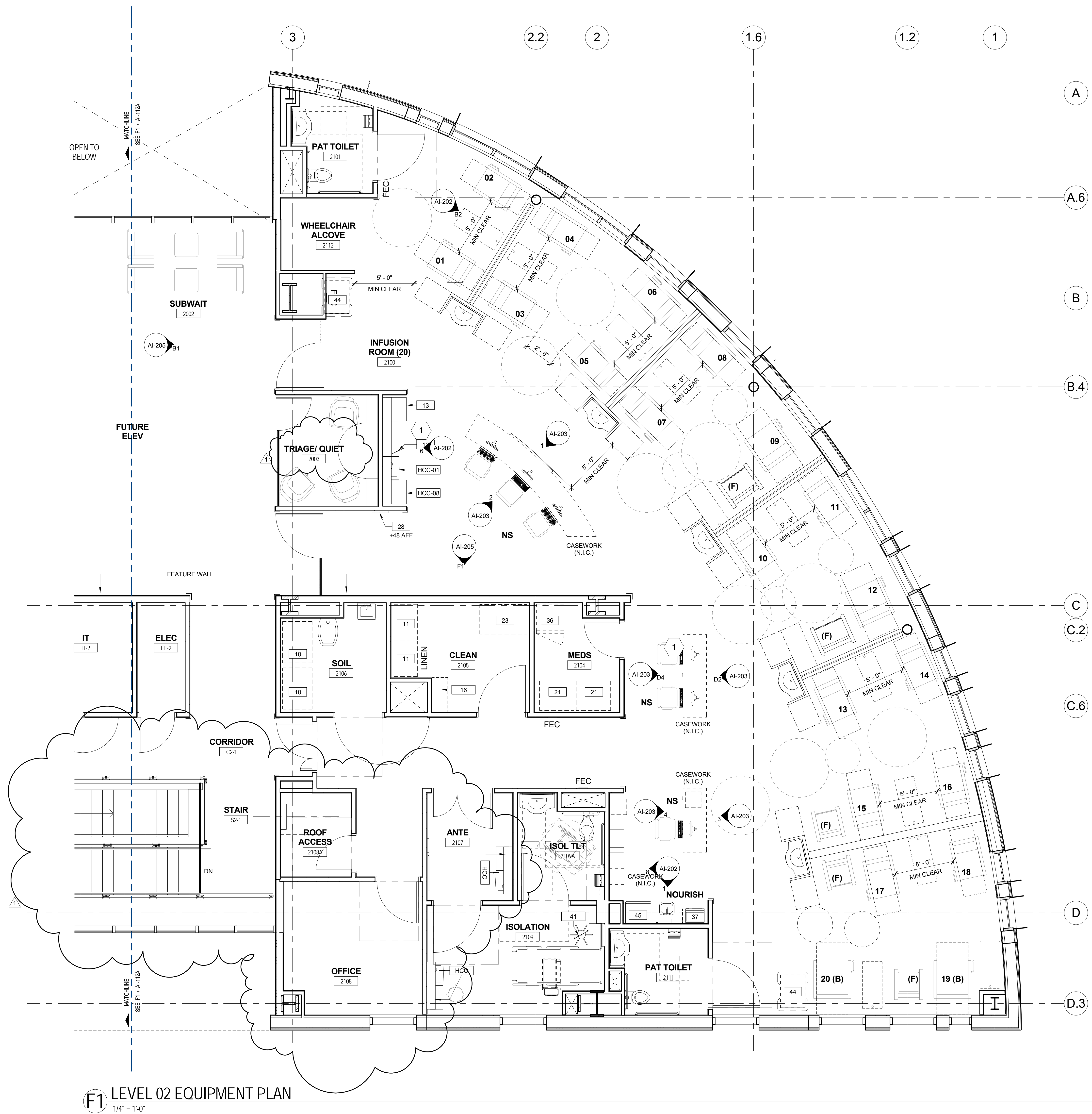
F1 LEVEL 02 EQUIPMENT PLAN 1/4" = 1'-0"

one eighth inch = one foot one quarter inch = one foot one half inch = one foot three eighths inch = one foot three quarters inch = one foot one inch = one foot one and one half inches = one foot two inches = one foot three inches = one foot