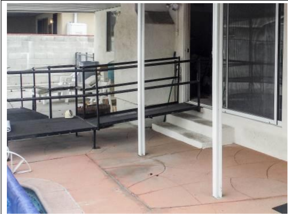
PHOTO #2 - EXISTING DINING ROOM EXIT, 10' SLIDING GLASS DOOR AND EXIT RAMP