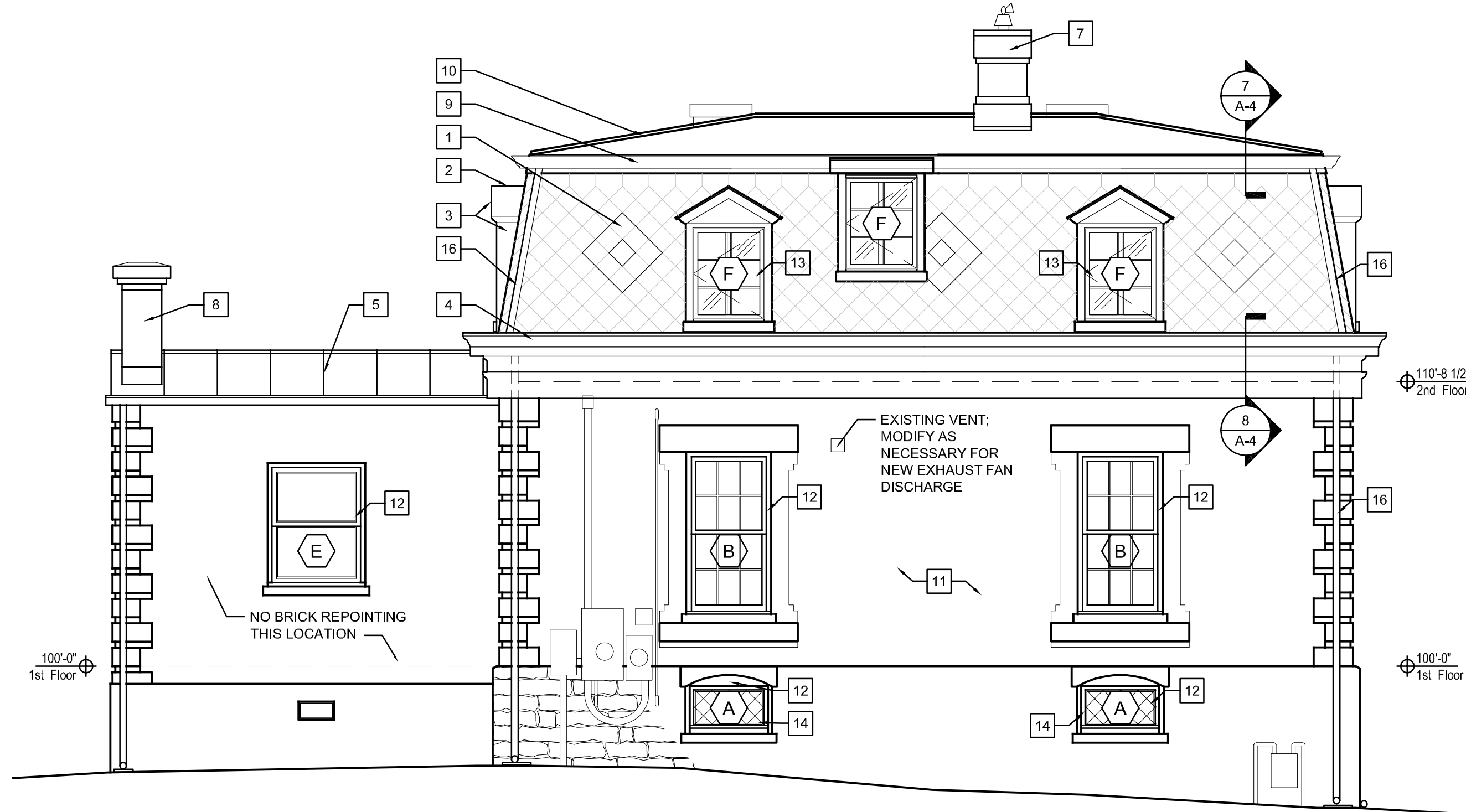
2 NORTH ELEVATION A-3 Scale: 1/4" = 1'-0"