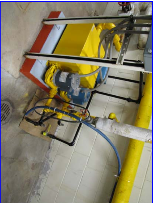
F11 NOT TO SCALE