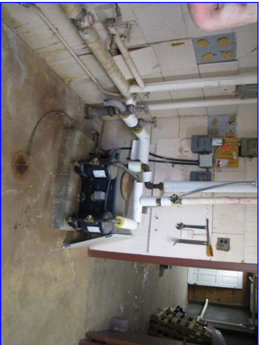
D16 NOT TO SCALE BUILDING 16, BASEMENT MECHANICAL ROOM