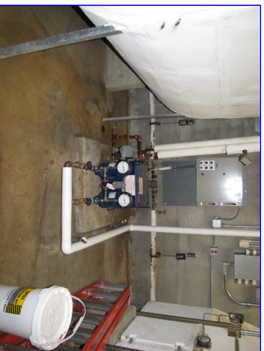
H5 NOT TO SCALE BUILDING 5, GROUND FLOOR, ROOM A12