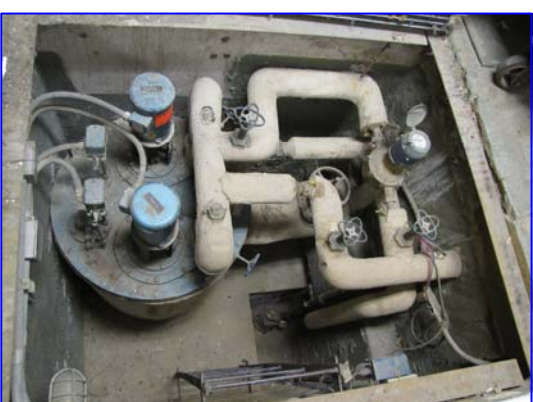
E1 NOT TO SCALE BUILDING 1, BASEMENT MECHANICAL ROOM,