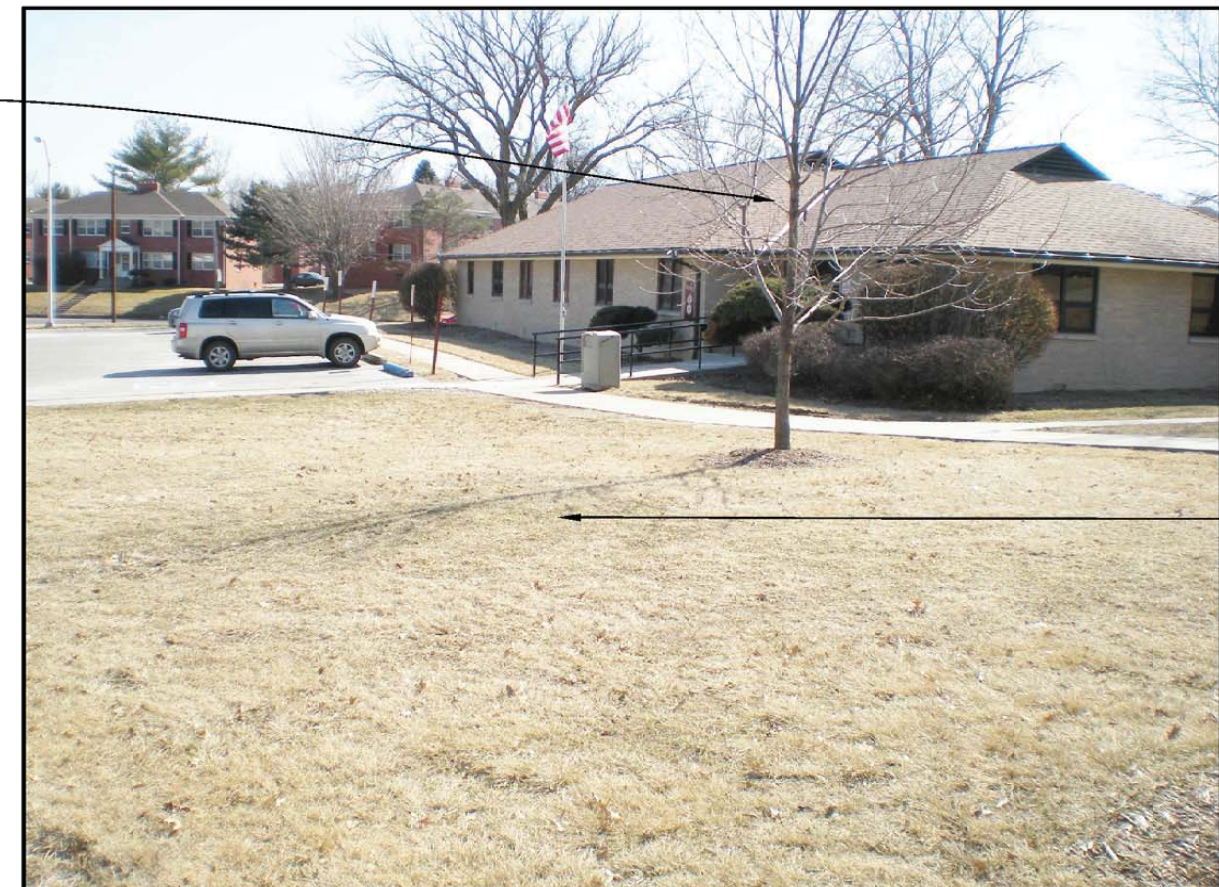
6 EXISTING BUILDING "8" LOOKING SOUTH SCALE: NONE