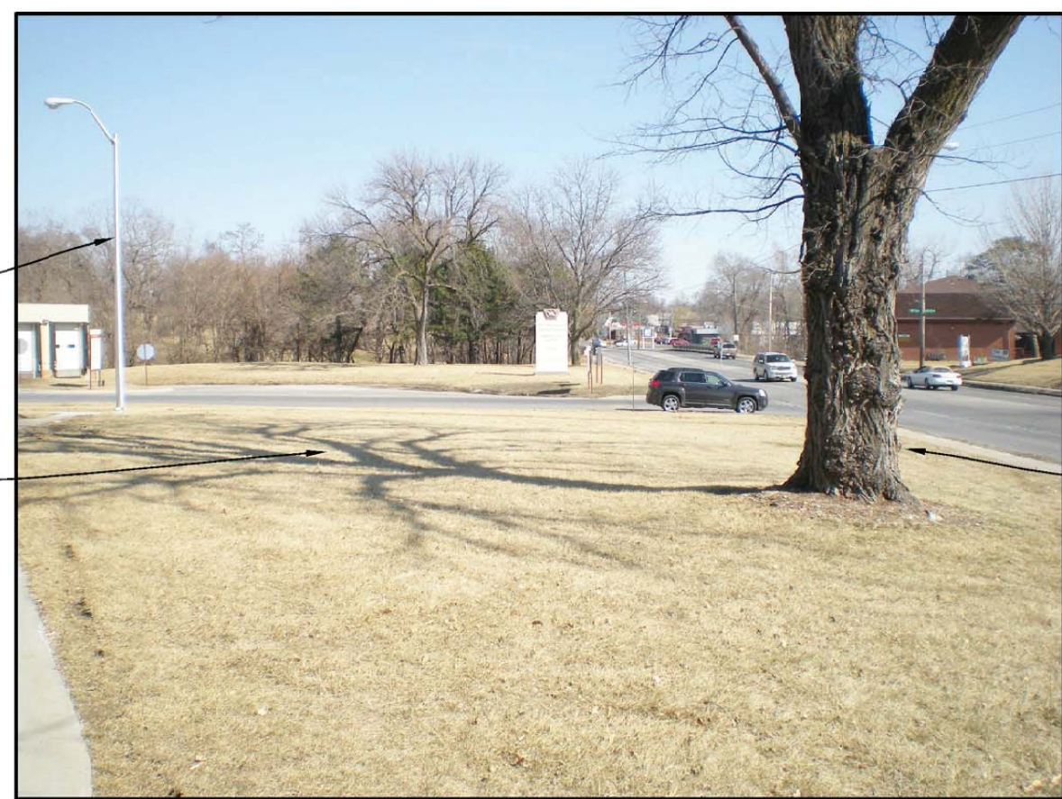
3 EXISTING SITE LOOKING EAST ALONG CENTER STREET SCALE: NONE