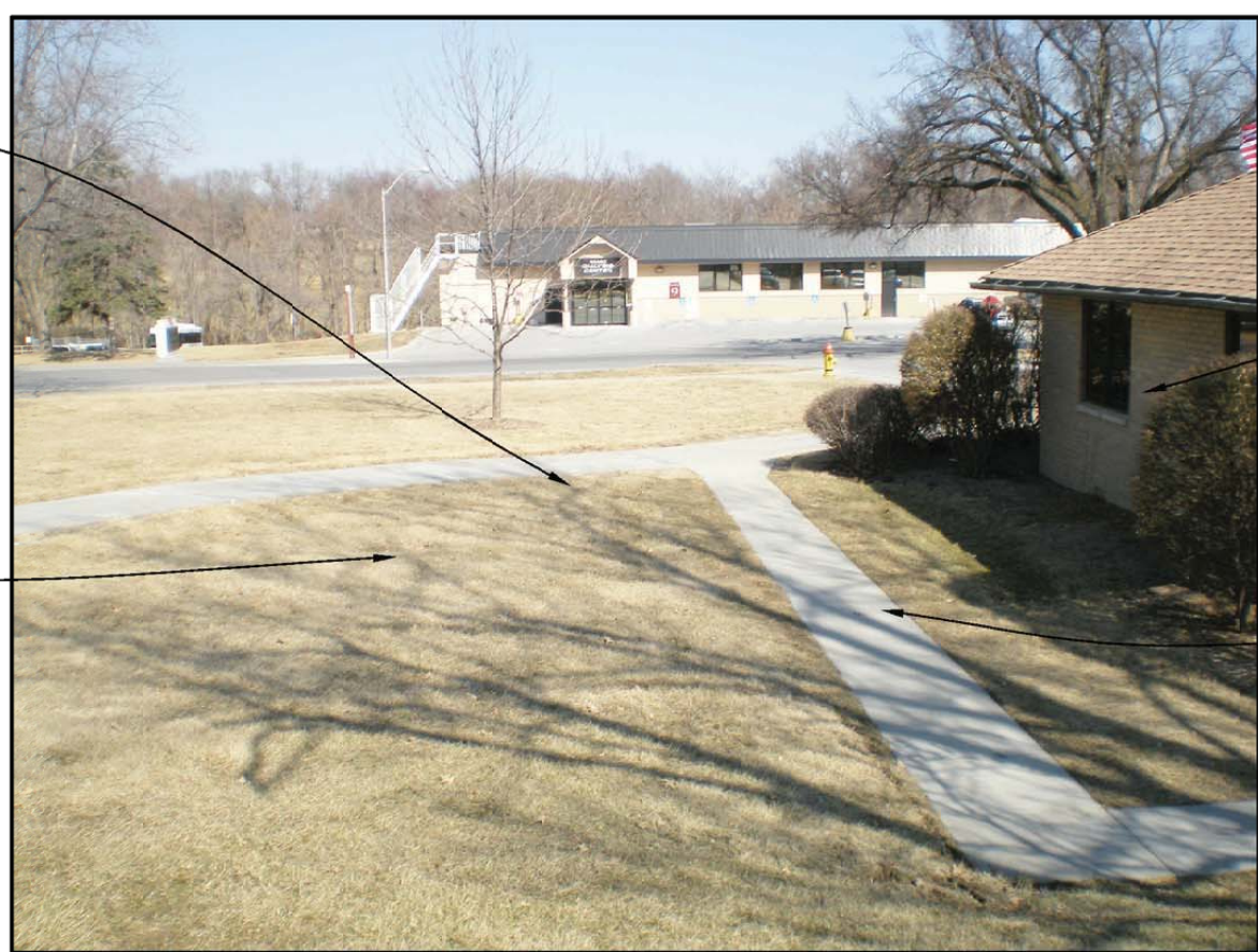
2 EXISTING BUILDING "8" LOOKING NORTHWEST SCALE: NONE