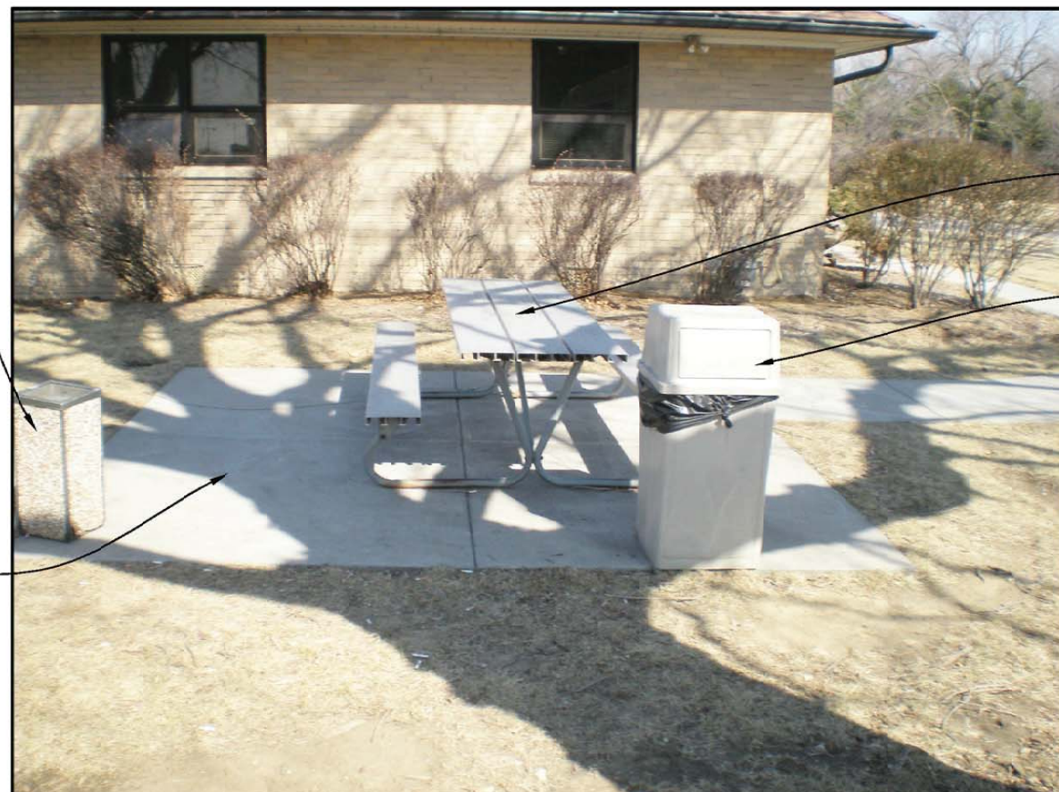
4 EXISTING BUILDING "8" PICNIC TABLE PAD SCALE: NONE