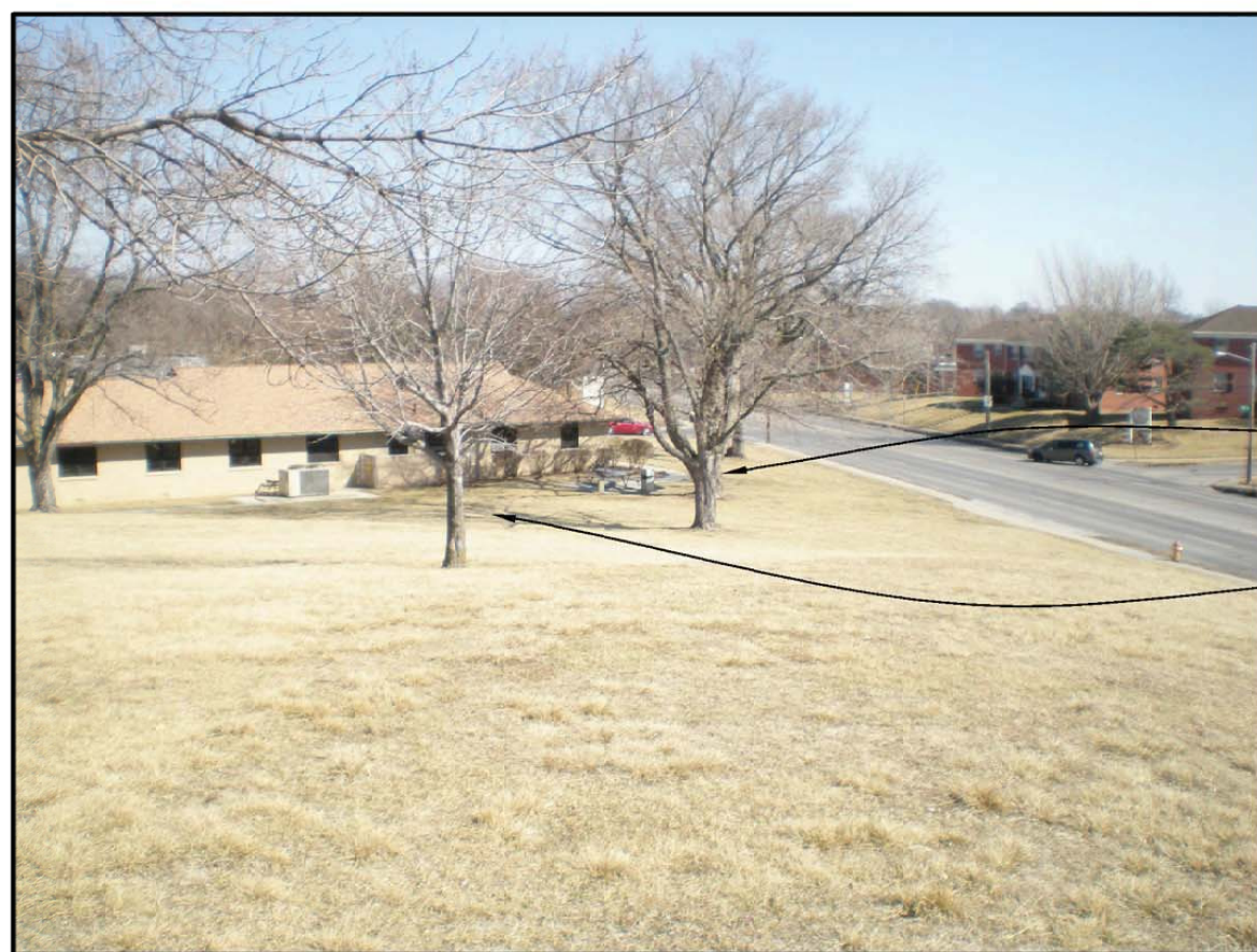
1 EXISTING BUILDING "8" LOOKING EAST SCALE: NONE