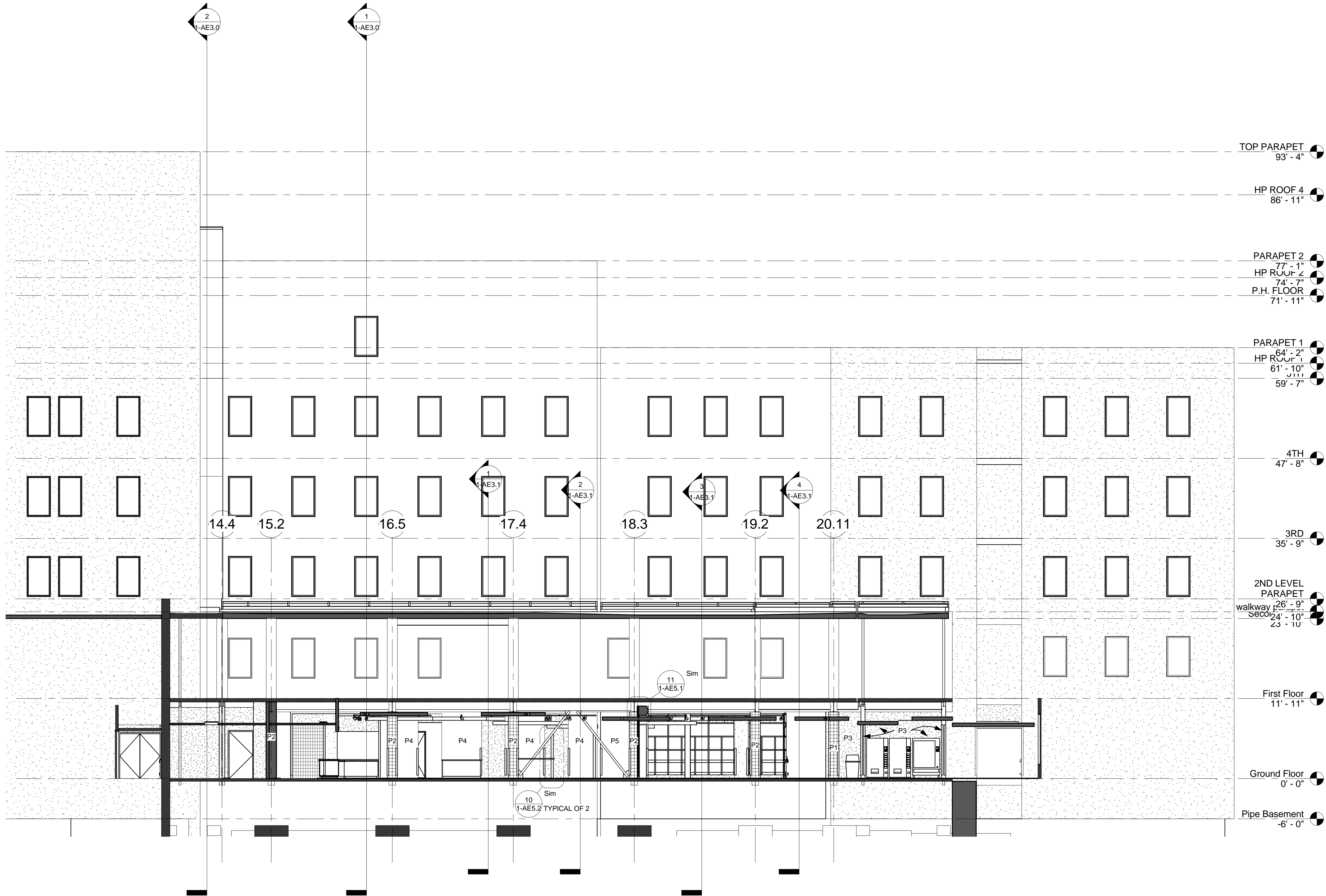
1 Section A-2 Looking east 1/8" = 1'-0"

three inches = one foot one and one half inches = one foot one inch = one foot three quarters inch = one foot one half inch = one foot three eighths inch = one foot one quarter inch = one foot one eighth inch = one foot