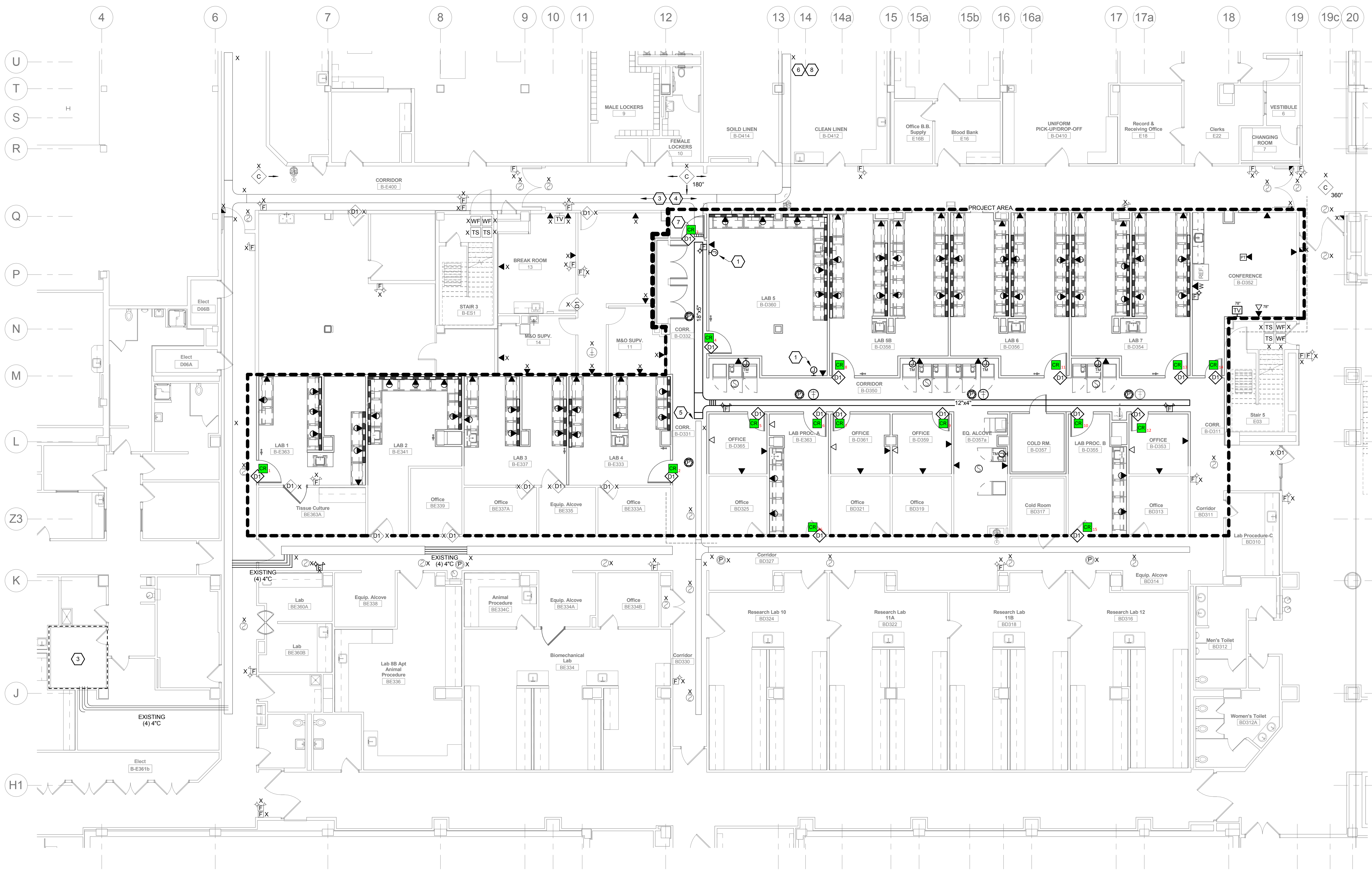
PARTIAL BASEMENT TELECOMMUNICATION PLAN 1/8" = 1'-0" 0' 4' 8' 16' 32'

three inches = one foot one and one half inches = one foot one inch = one foot three quarters inch = one foot one half inch = one foot one quarter inch = one foot one eighth inch = one foot