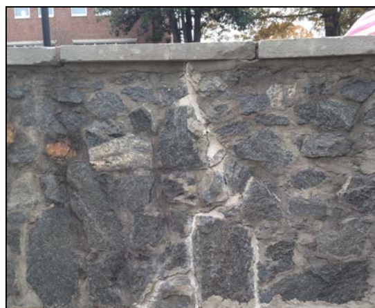
Figure 2. Unacceptable stone repair.

In order to successfully perform this work, the A/E shall identify and designate a Cultural Resources Manager who satisfies the requirements set forth by the Secretary of Interior's Professional Qualification Standards for Historic Preservation under Code of Federal Regulations, 36 CFR Part 61 < http://www.nps.gov/history/local-law/arch_stnds_9.htm >. In some cases, additional areas or levels of expertise may be needed, depending on the complexity of the task and the nature of the historic properties involved.