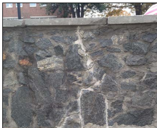
Figure 2. Unacceptable stone repair.

In order to successfully perform this work, the A/E shall identify and designate a Cultural Resources Manager who satisfies the requirements set forth by the Secretary of Interior's Professional Qualification Standards for Historic Preservation under Code of Federal Regulations, 36 CFR Part 61 < http://www.nps.gov/history/local-law/arch_stnds_9.htm >. In some cases, additional areas or levels of expertise may be needed, depending on the complexity of the task and the nature of the historic properties involved.