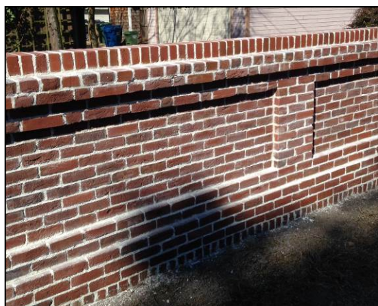
Figure 1. Acceptable brick repair.

Common examples of historic preservation work might include, but is not limited to stone repairs with natural hydraulic lime (refer to Figures 1 and 2 that illustrate acceptable and unacceptable repair conditions); iron repair for gates, fences, posts, cannons, and other objects or heritage assets; laser scanning and building information modeling studies; and the preparation of Historic Structures Reports, Facility Condition Assessments, Cultural Landscape Reports, and other documentation that follow Historic American Building Survey (HABS), Historic American Landscape Survey (HALS), and Historic American Engineering Record (HAER) standards.