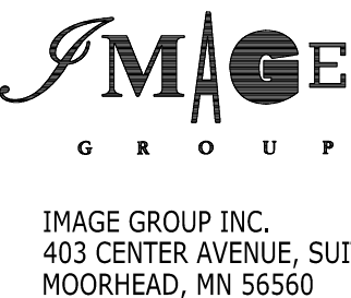
IMAGE GROUP INC., Architecture & Interiors SOLEN & LARSON ENGINEERING, Structural Engineers OBERMILLER NELSON ENGINEERING, Mechanical Engineers MEN ENGINEERING, Electrical Engineers

Dept. of Veterans Affairs Medical Center 2101 Elm Street North Fargo, ND 58102