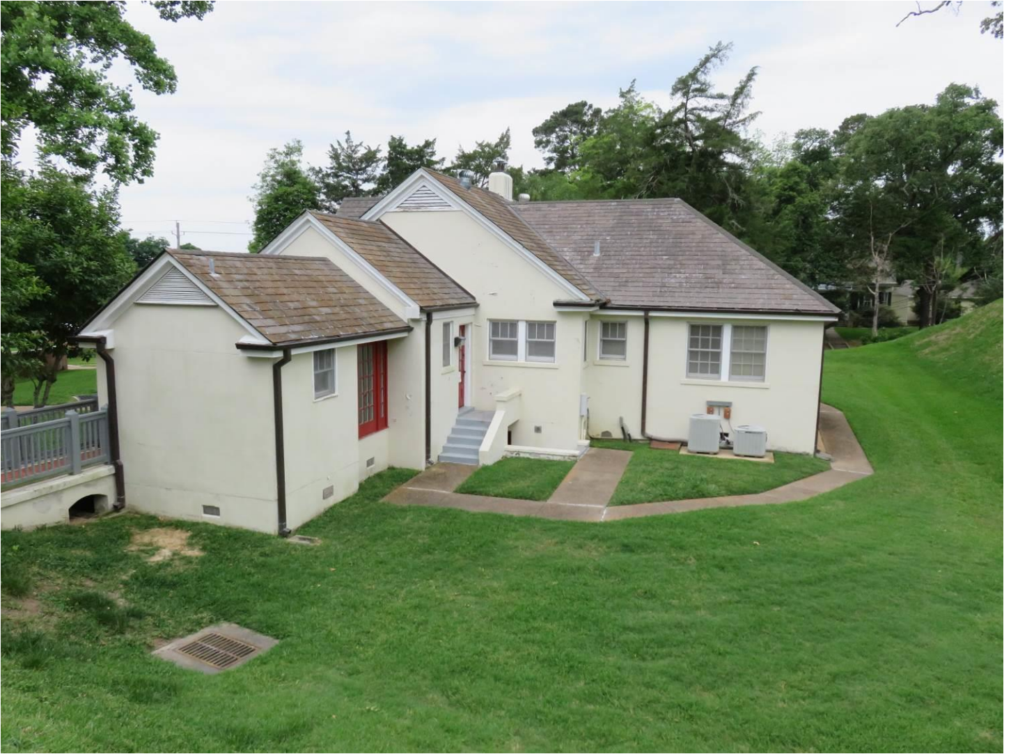
Figure 4: East side of building, rear entrance; public restrooms in foreground