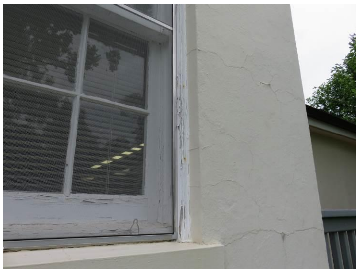
Figure 3: Condition of window frame, sash, and muntin (typ.)