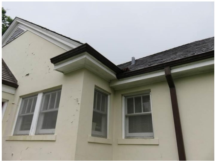
Figure 6: Close up of East side