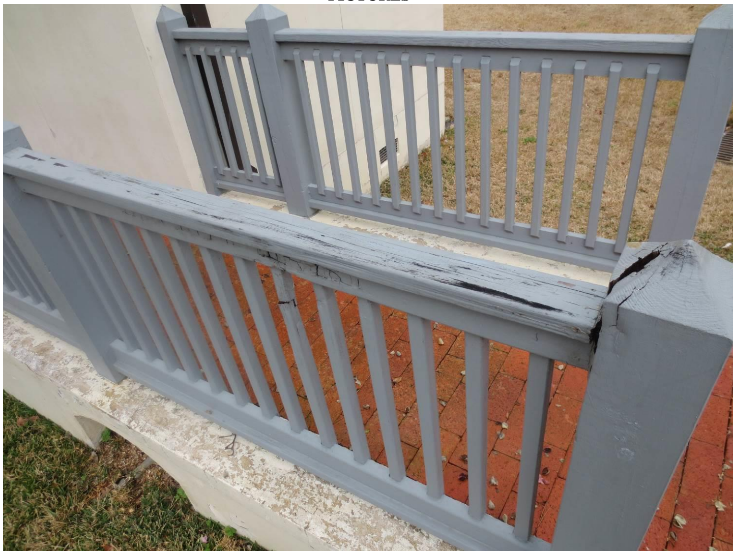
Figure 19: Public restroom railing to be replaced