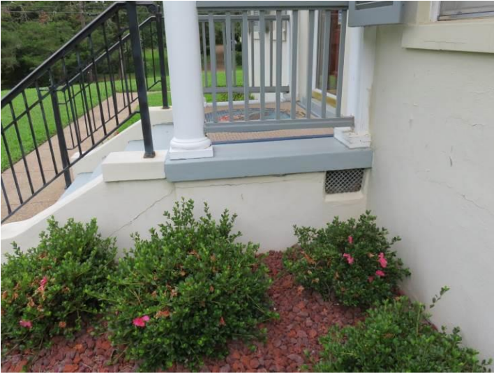
Figure 10: Side of entrance steps