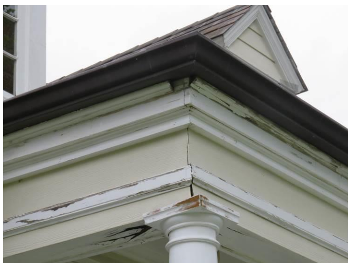
Figure 9: Detail of overhang moulding (typ.)