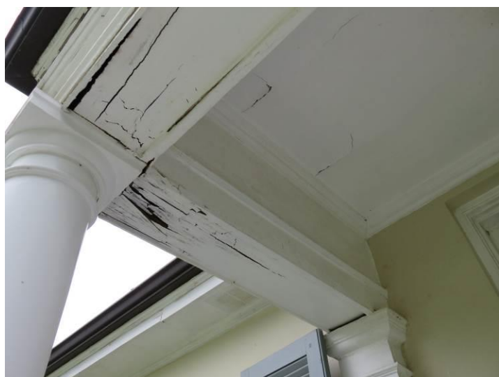
Figure 8: Casing to be replaced