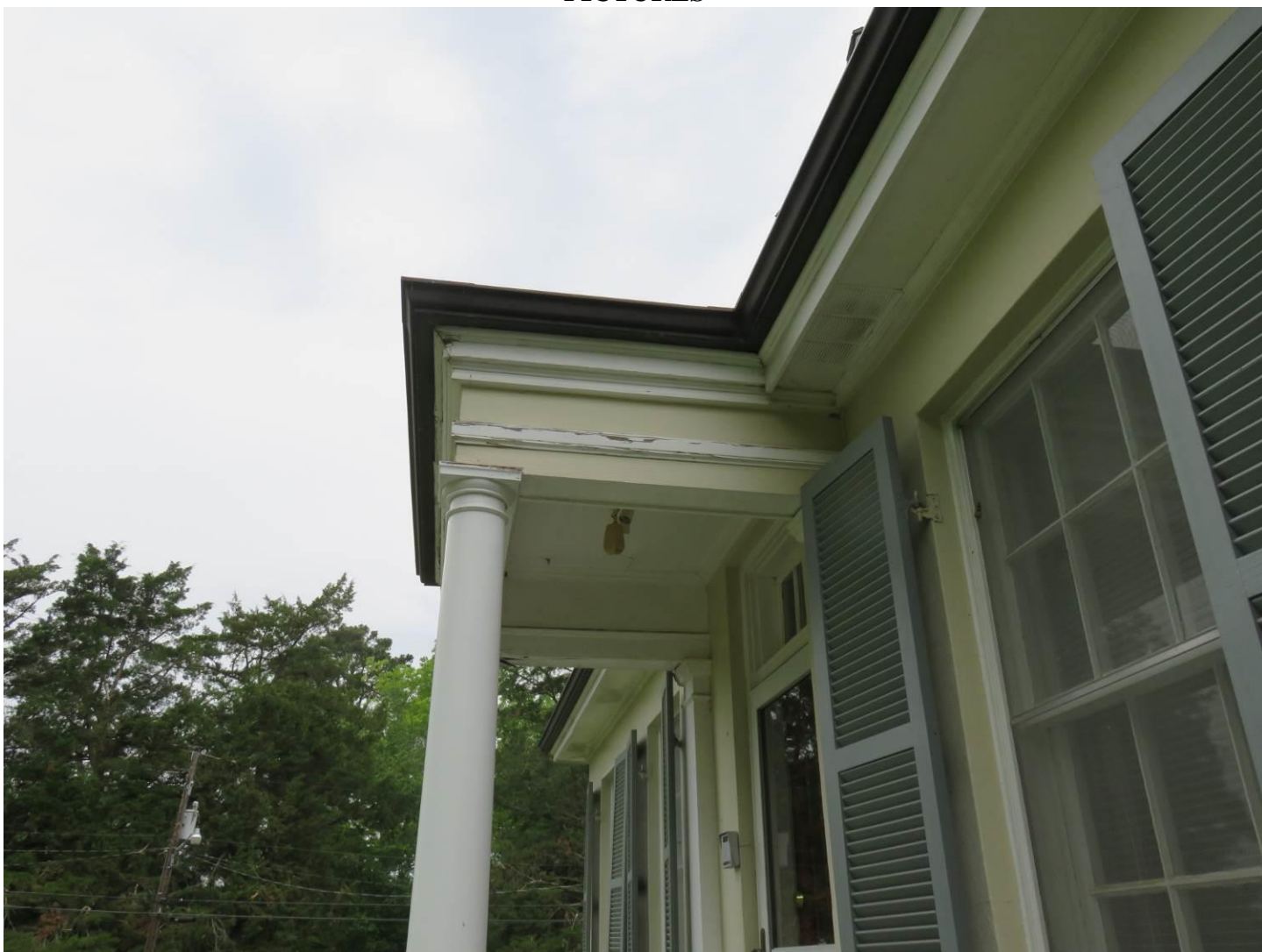
Figure 7: Front entrance overhang