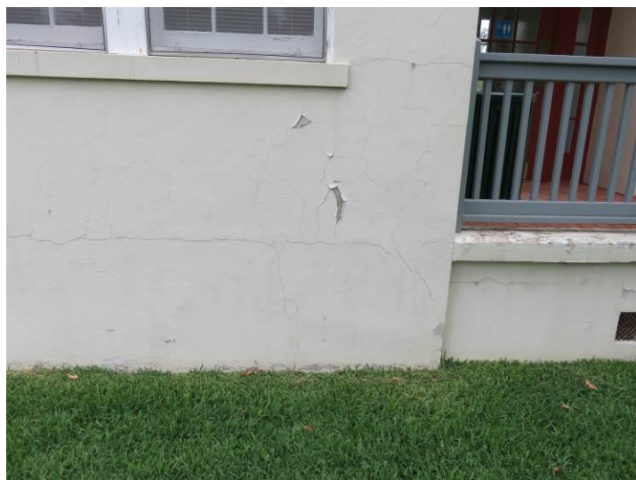
Figure 2: Condition of stucco (typical)