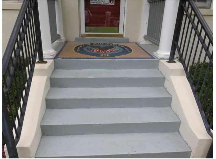
Figure 11: Front of steps