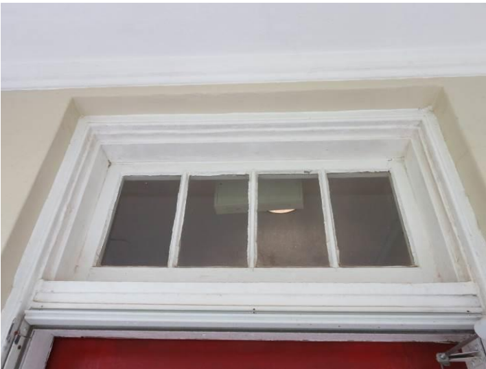
Figure 12: Over-door light