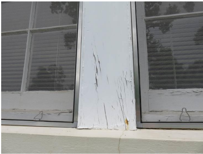
Figure 5: Condition of window divider (typ.)