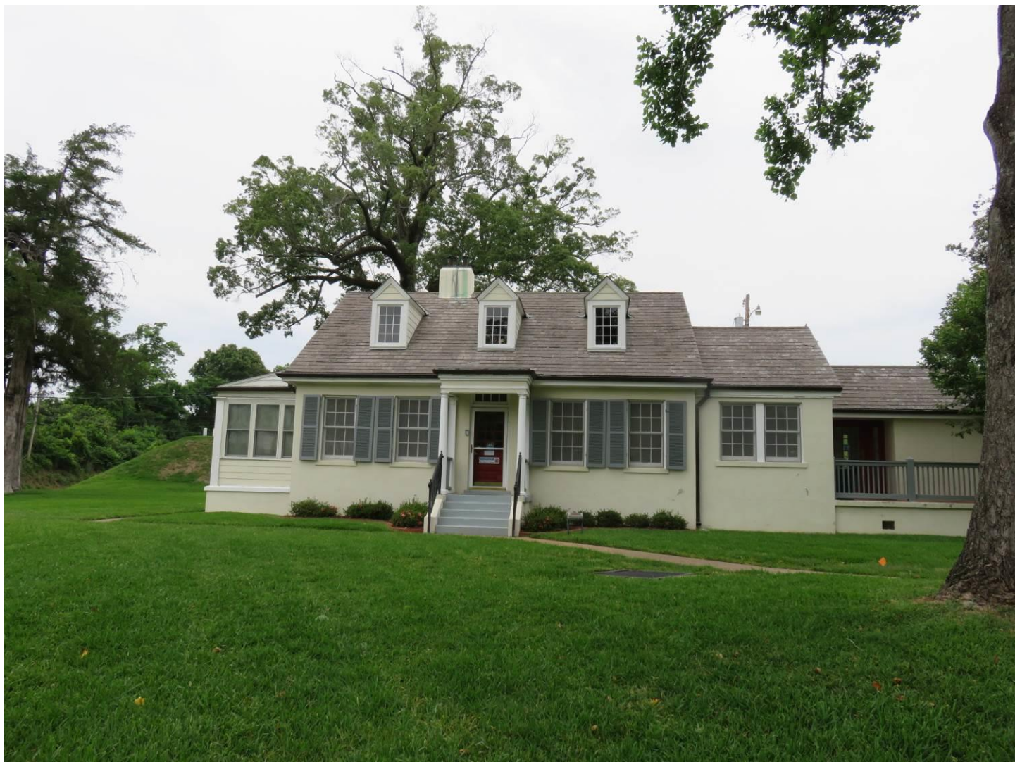
Figure 1: Front of building (South side), entrance; public restrooms on right