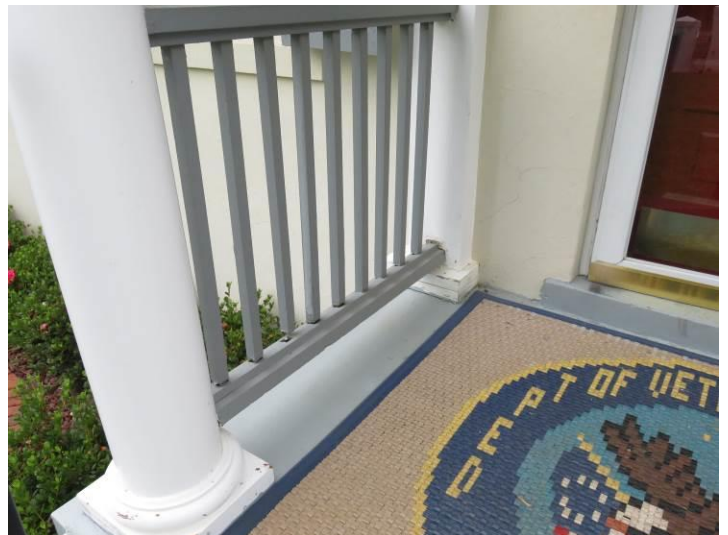
Figure 15: Entrance railing to be replaced