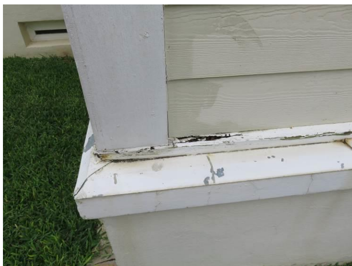
Figure 17: Rotten enclosed porch sill plate