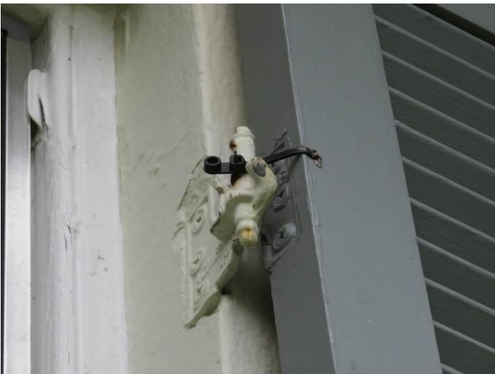
Figure 14: Shutter hardware to be replaced (typ.)