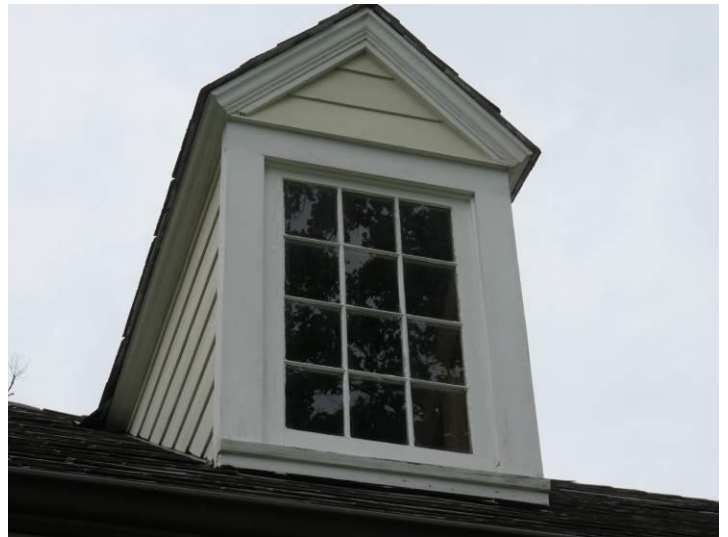
Figure 13: Dormer (typical of three)