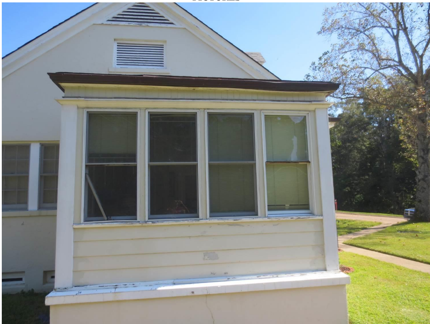
Figure 16: West side of porch enclosure; repair upper sash, outer two windows