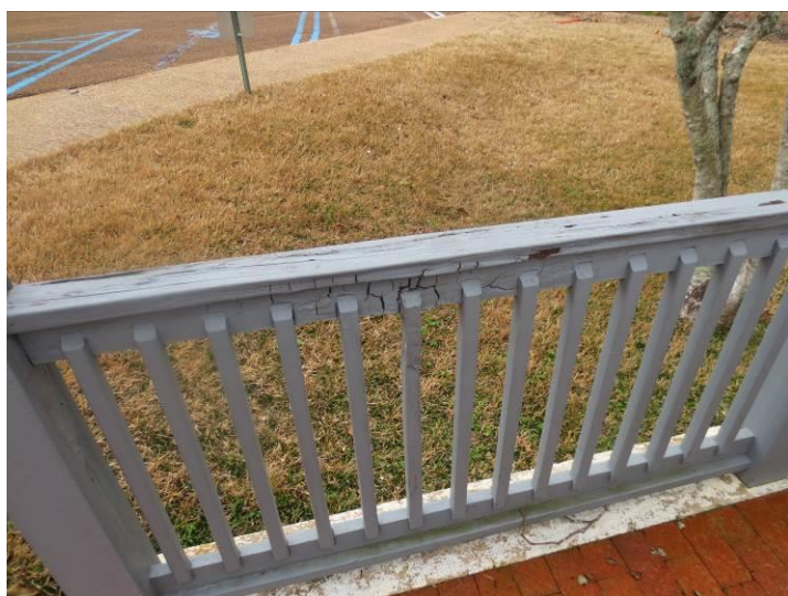
Figure 20: Public restroom railing to be replaced