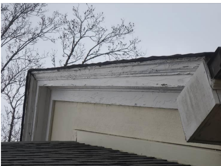
Figure 21: Condition of gable trim and moulding (typ.)